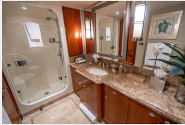
VIP Guest Bath