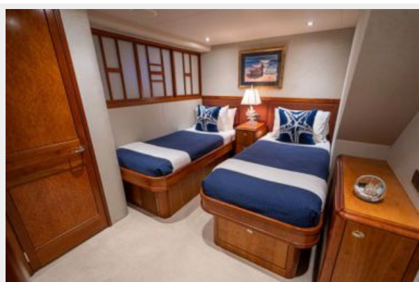
Twin Guest Stateroom