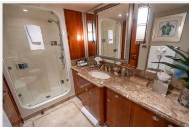
VIP Guest Bath