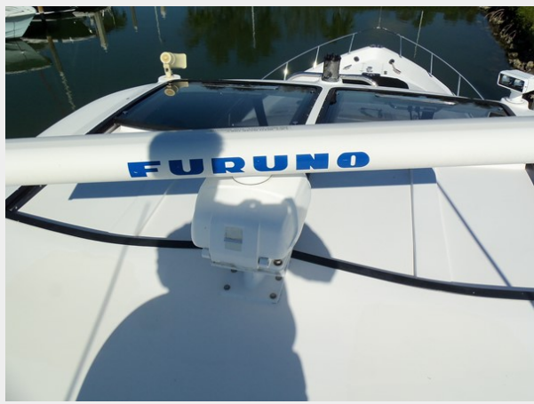
Coach Roof Equipment