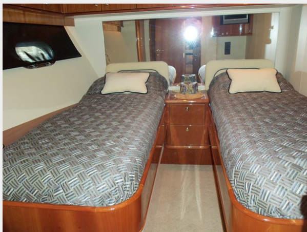
Starboard Guest Cabin Looking Forward