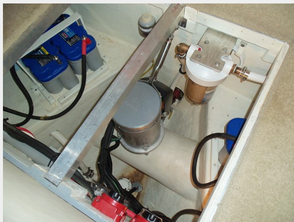
Bow Thruster Below VIP