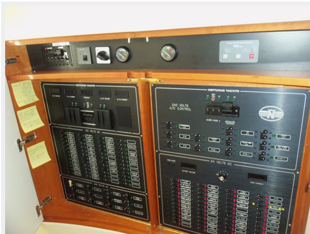
Accommodation Stairs Electrical Panel