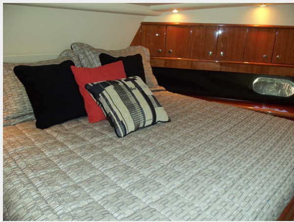
VIP to Starboard