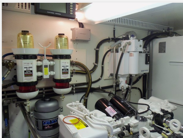
Forward of Starboard Engine