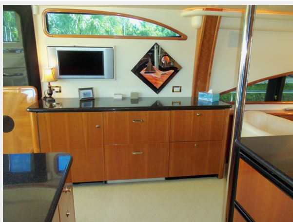
Galley to Starboard