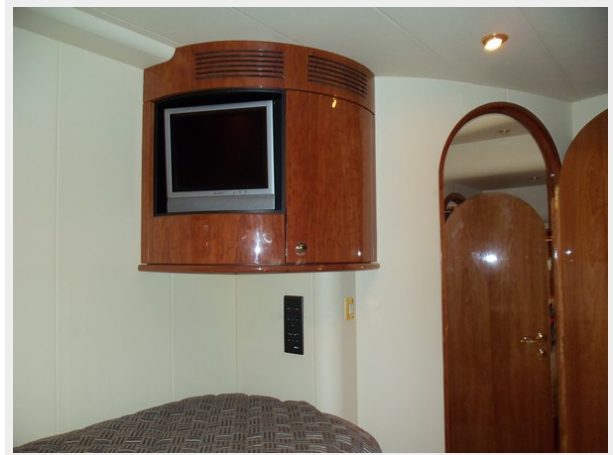
Starboard Guest Cabin Looking Aft