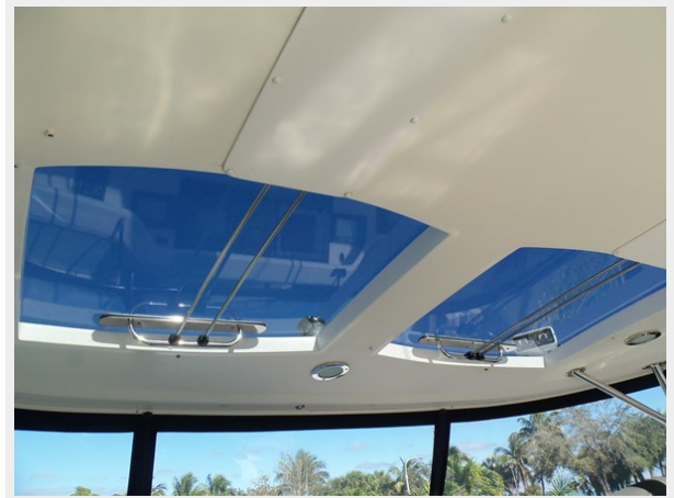
Dual Electric Sunroof