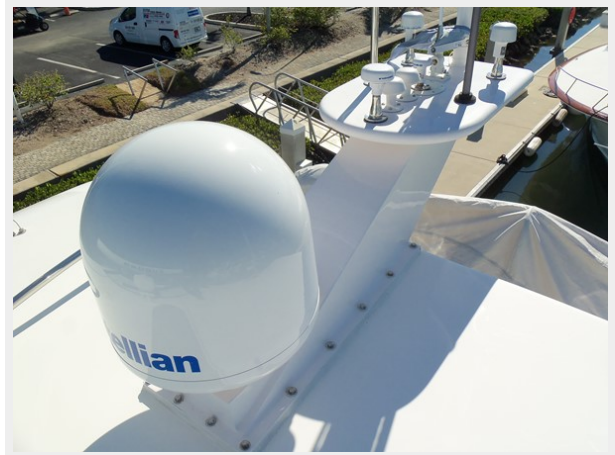
Coach Roof Mast