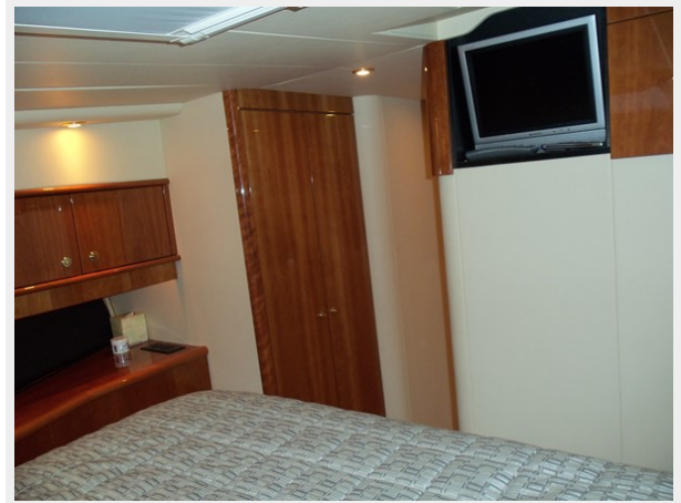
VIP Looking Aft