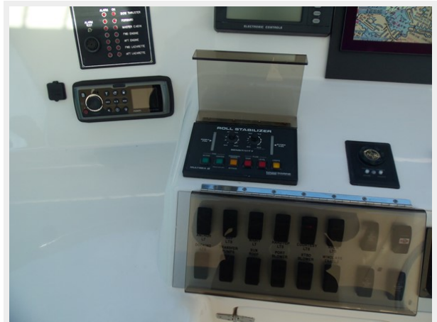
Flybridge Helm Portside Detail