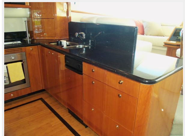
Galley Looking Forward