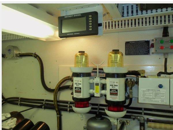
Forward of Port Engine