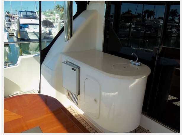
Aft Deck Bar