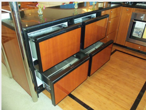
Galley Refrigerator Drawers