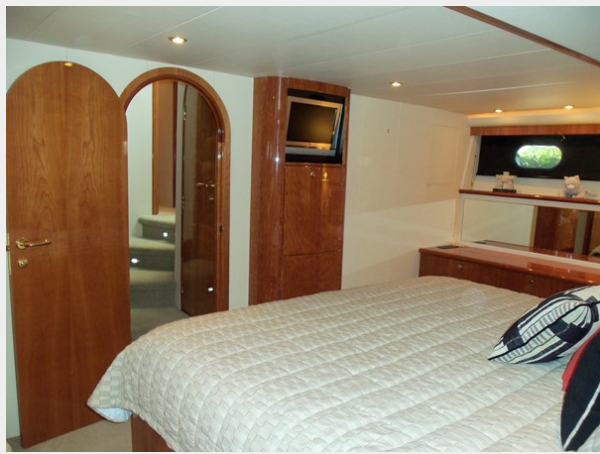
Master Looking Forward