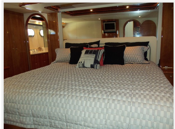
Master Looking Aft