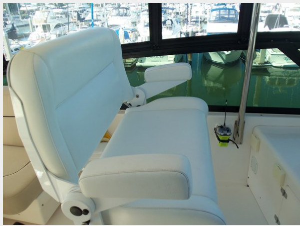
Double Stidd Companion Seat