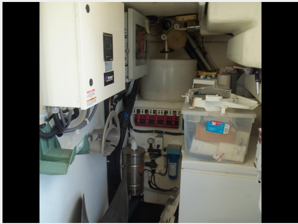
Lazarette to Starboard