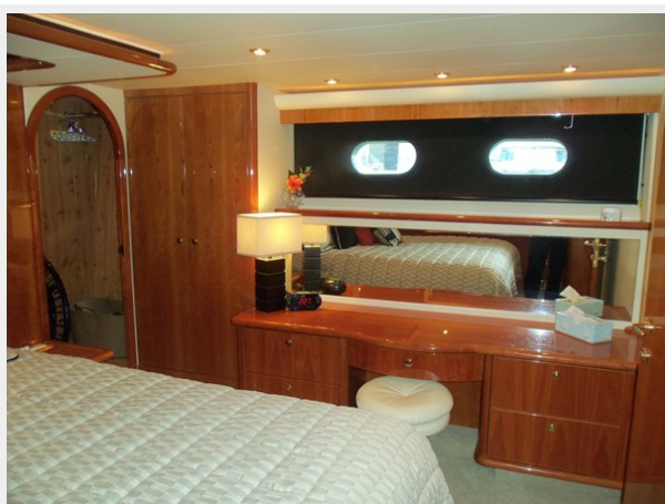
Master Looking to Port