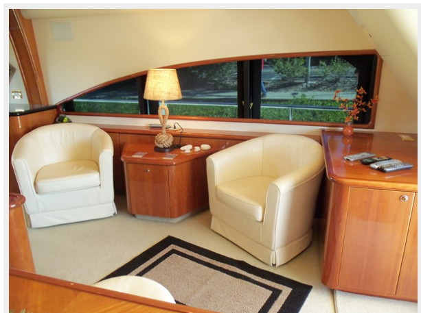
Salon to Starboard