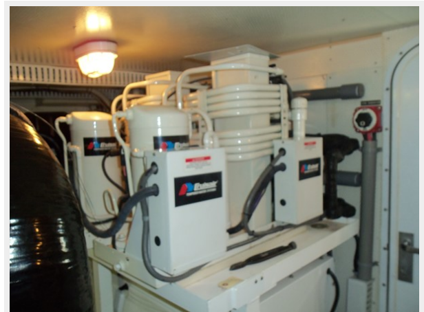
AC Plants aft of Starboard Engine