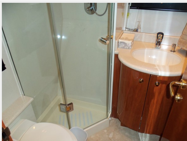
Starboard Guest Cabin Head