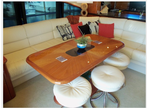
Salon Settee to Port