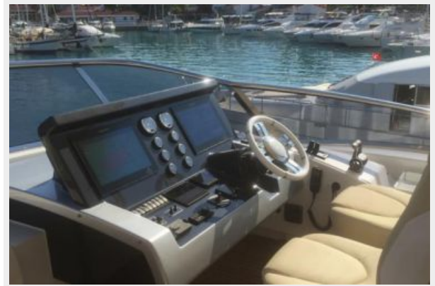
Helm station on flybridge