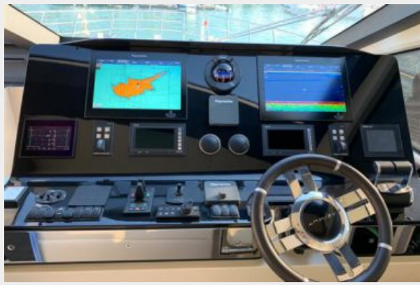
Main helm station