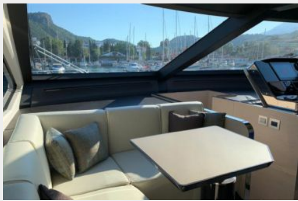
Seating area near helm station