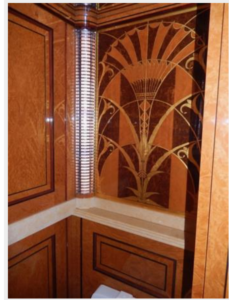
Day Head Marquetry