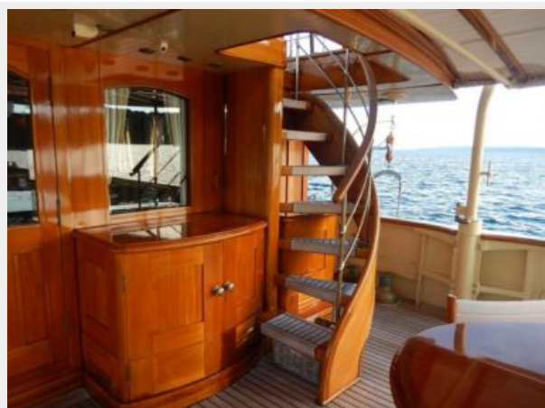
To Upper Deck