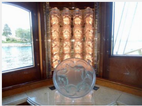
Lalique Panels and Plates