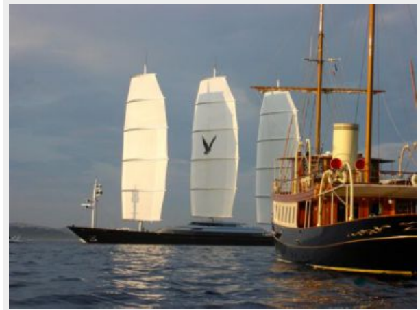
Maltese Falcon and Atlantide