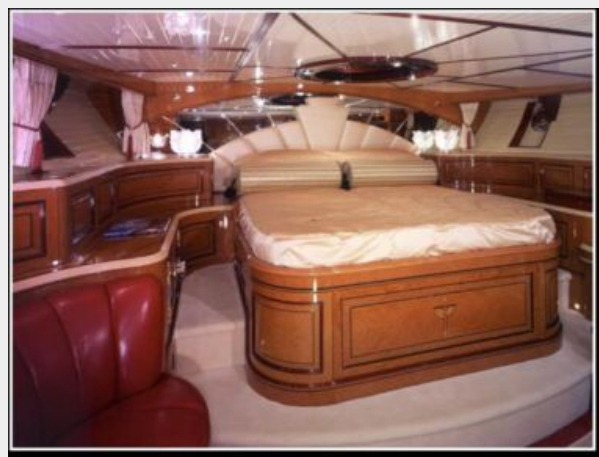
Master Stateroom Aft