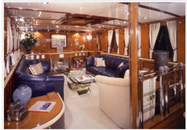
Main Salon Forward