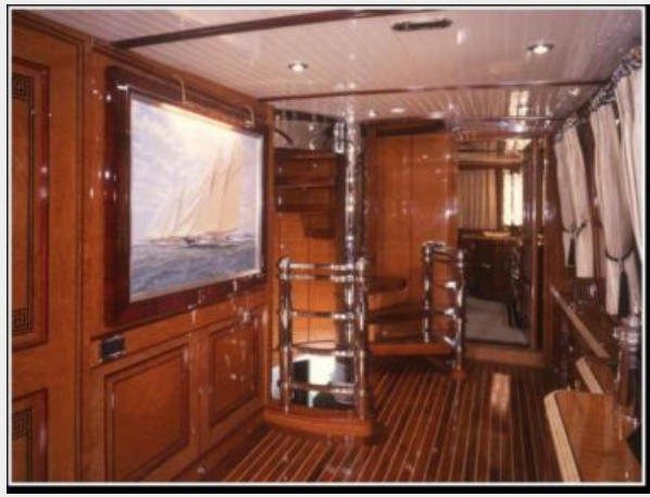
Main Deck Lobby