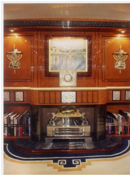
Fireplace and Mantle