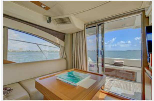
47 AZIMUT (16)