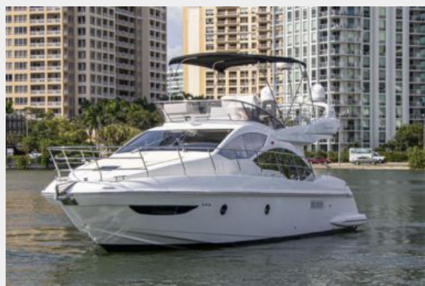
47 AZIMUT R