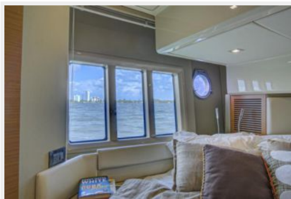
47 AZIMUT (25)