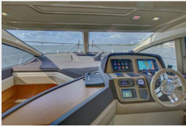
47 AZIMUT (11)