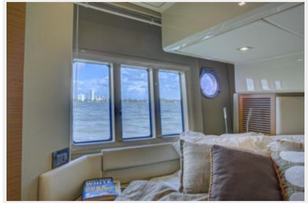
47 AZIMUT (25)