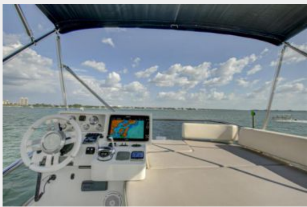
47 AZIMUT (42)