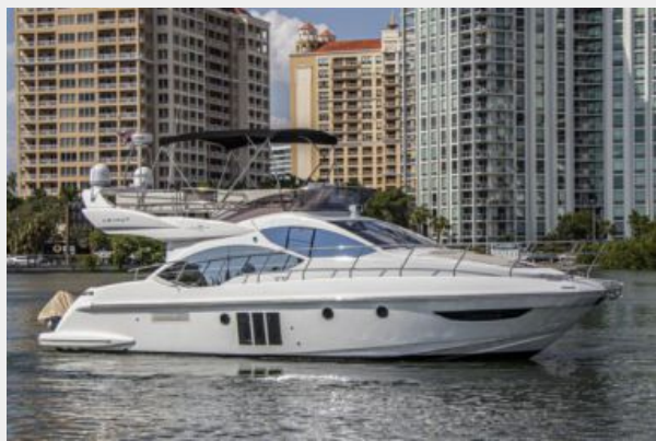
47 AZIMUT M