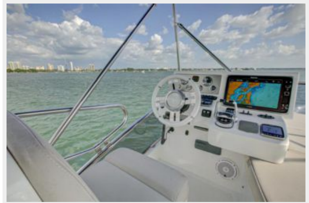
47 AZIMUT (41)