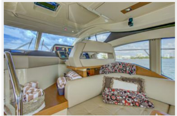
47 AZIMUT (6)