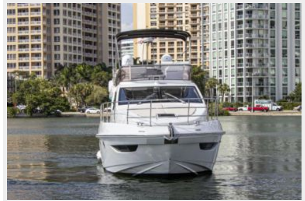
47 AZIMUT P