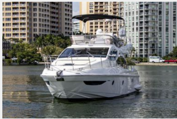
47 AZIMUT Q