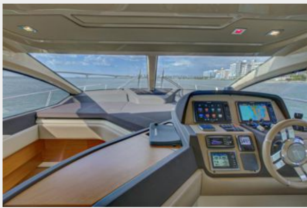
47 AZIMUT (10)