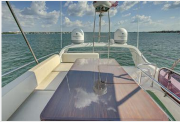
47 AZIMUT (48)