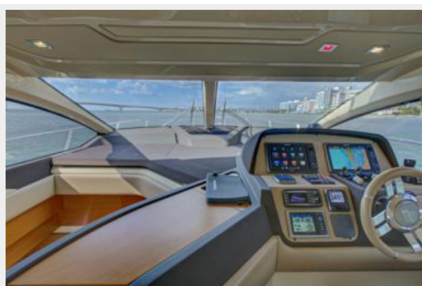
47 AZIMUT (10)