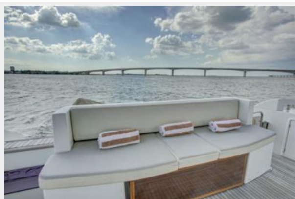
47 AZIMUT (37)