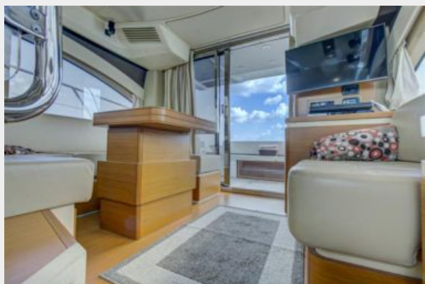
47 AZIMUT (19)