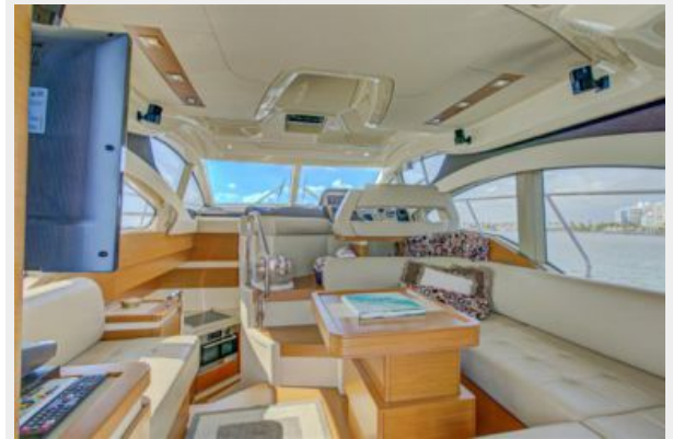
47 AZIMUT (3)