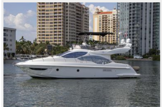
47 AZIMUT A