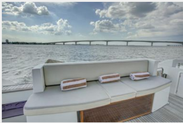
47 AZIMUT (37)