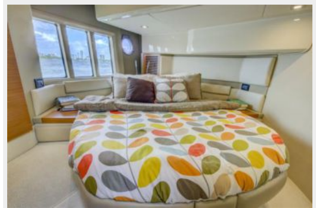
47 AZIMUT (23)