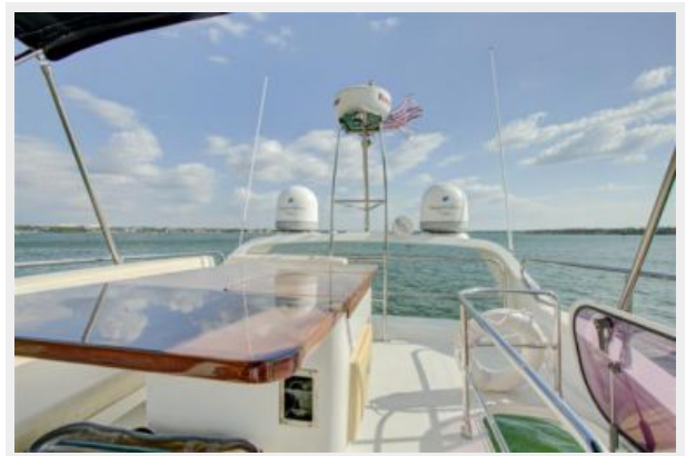
47 AZIMUT (44)