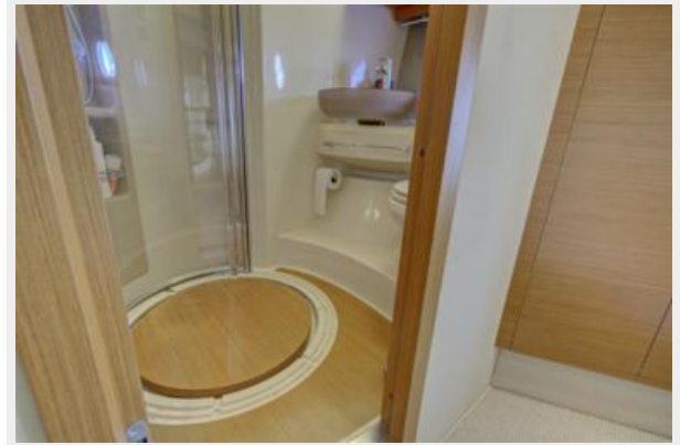
47 AZIMUT (24)