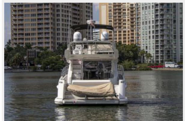
47 AZIMUT E