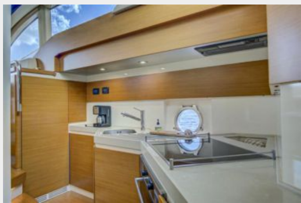
47 AZIMUT (21)