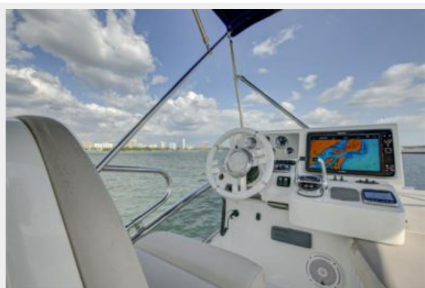
47 AZIMUT (40)