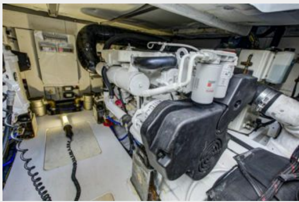
47 AZIMUT (2)