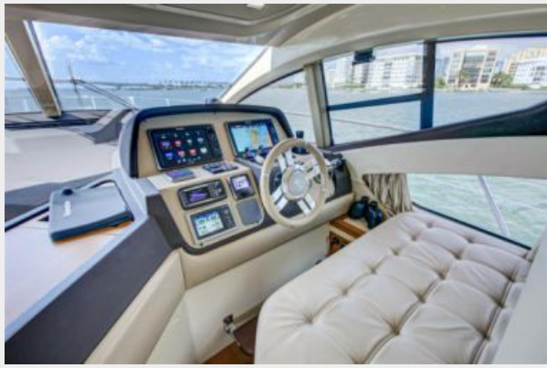
47 AZIMUT (9)