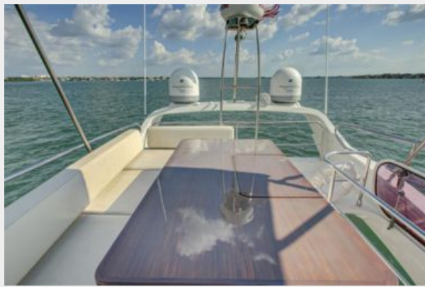
47 AZIMUT (48)