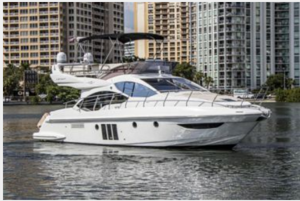
47 AZIMUT N