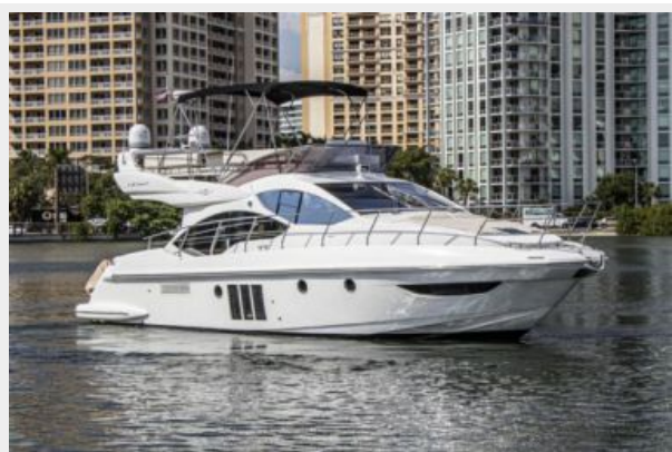
47 AZIMUT N