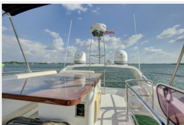
47 AZIMUT (45)