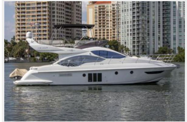
47 AZIMUT I