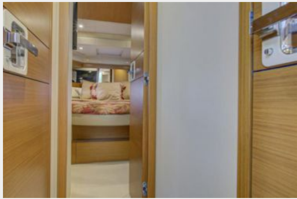
47 AZIMUT (26)