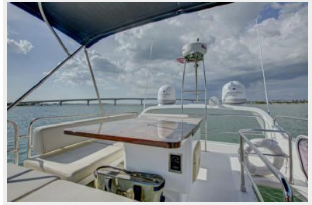
47 AZIMUT (43)