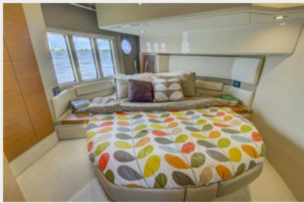
47 AZIMUT (22)