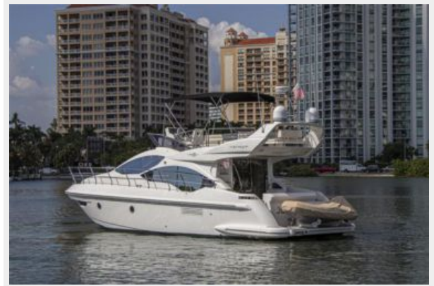
47 AZIMUT C