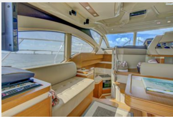
47 AZIMUT (5)