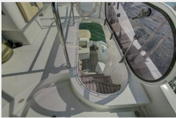
47 AZIMUT (47)