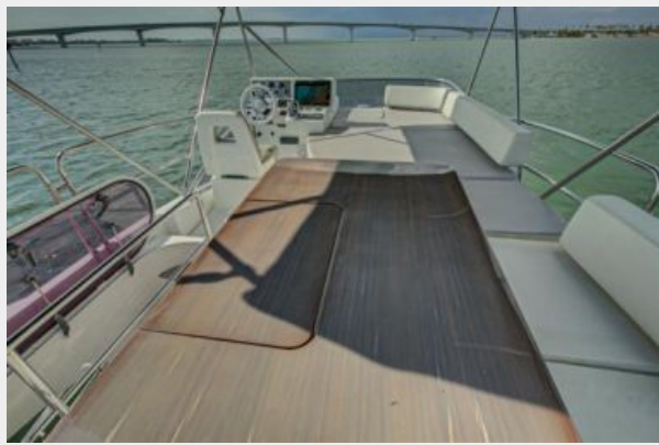
47 AZIMUT (46)