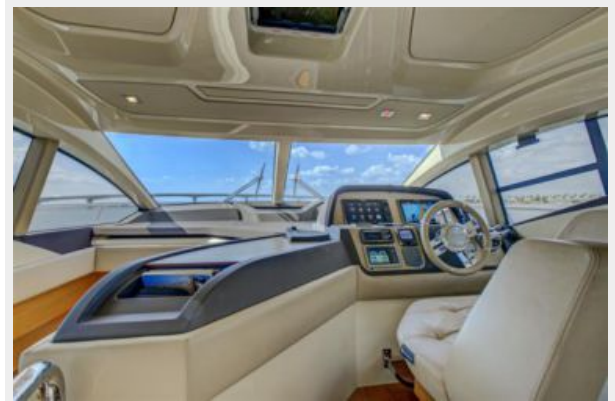
47 AZIMUT (8)