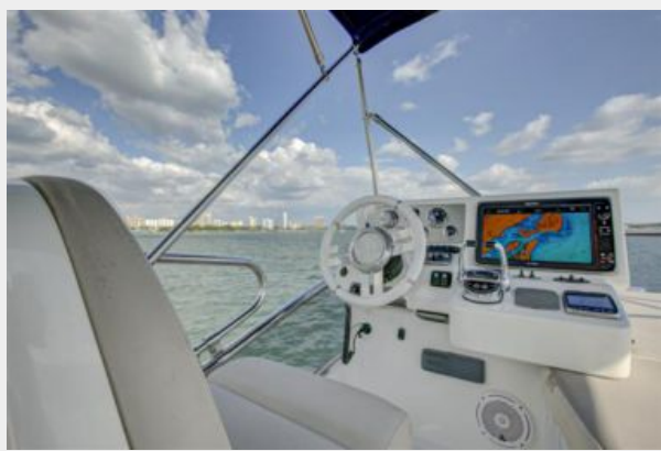
47 AZIMUT (40)