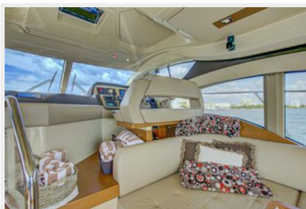
47 AZIMUT (6)