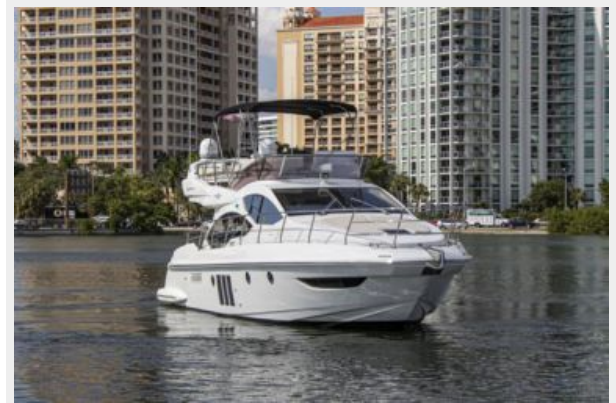
47 AZIMUT O