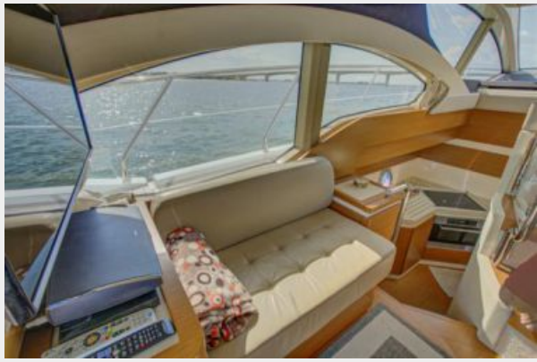
47 AZIMUT (13)