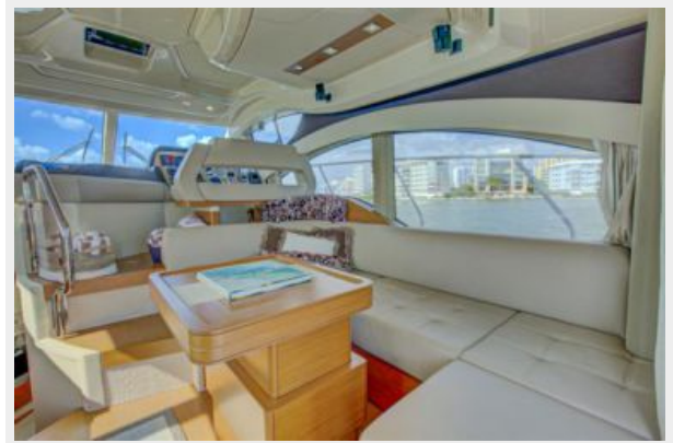
47 AZIMUT (4)