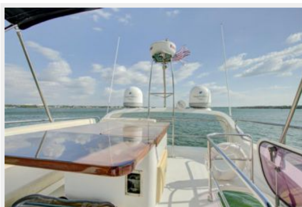
47 AZIMUT (44)