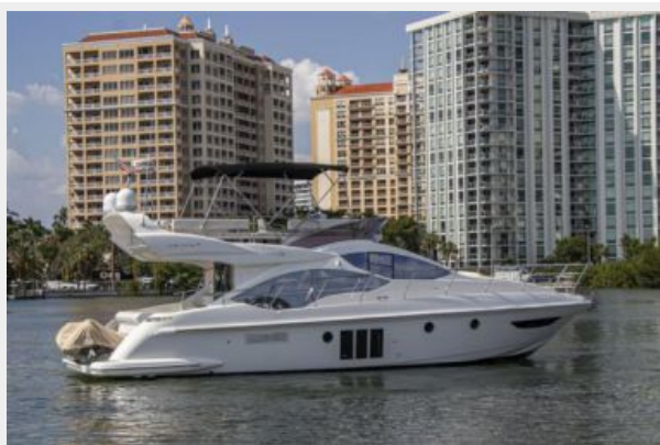
47 AZIMUT H