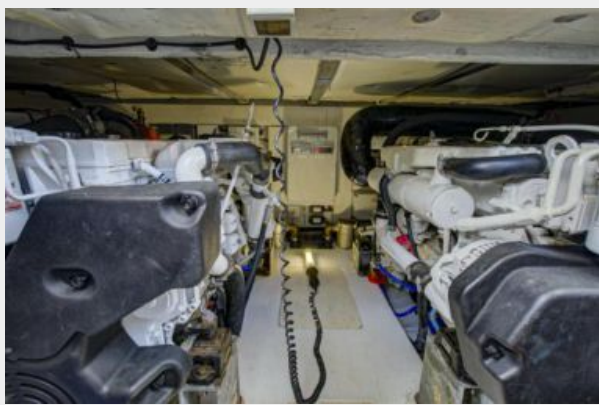
47 AZIMUT (1)