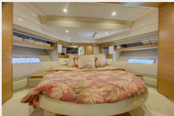
47 AZIMUT (27)