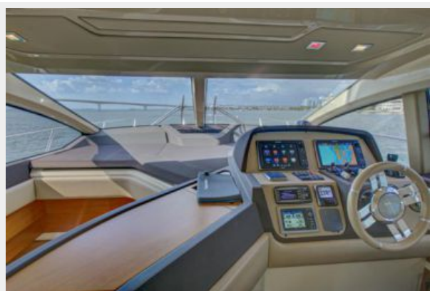
47 AZIMUT (11)