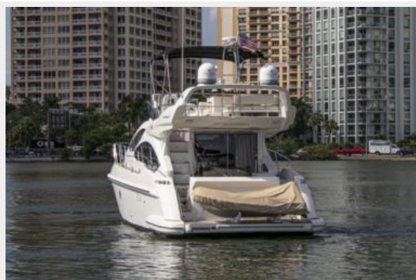
47 AZIMUT D