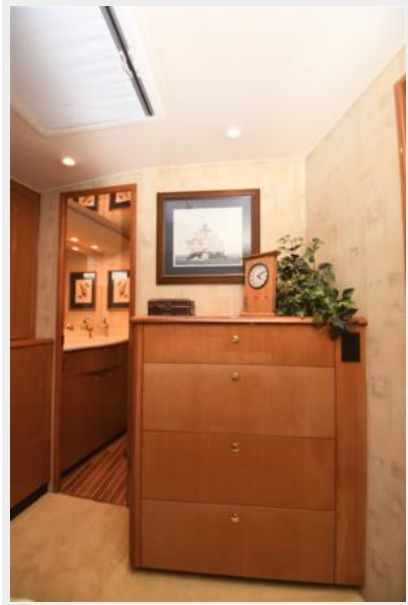
2004 61 Viking Master Stateroom