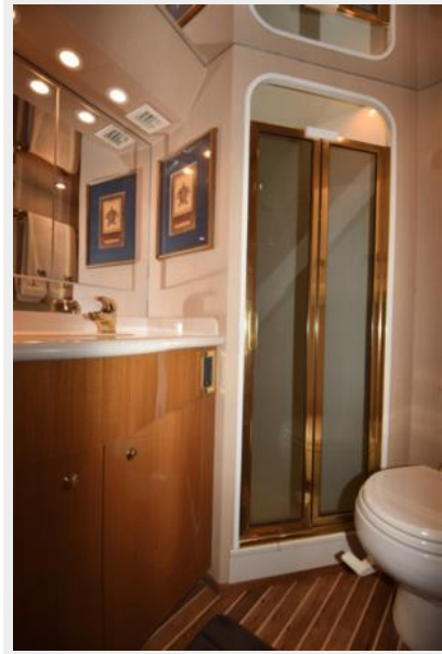
2004 61 Viking Guest Head