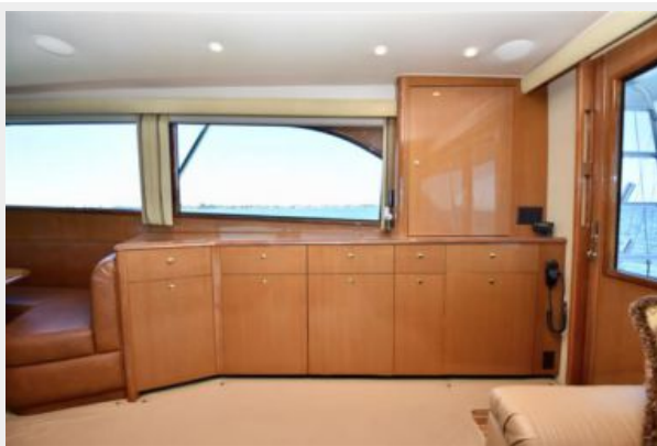
2004 61 Viking Salon