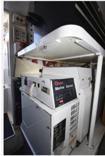
2004 61 Viking Engine Room