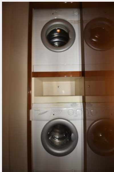
2004 61 Viking Laundry