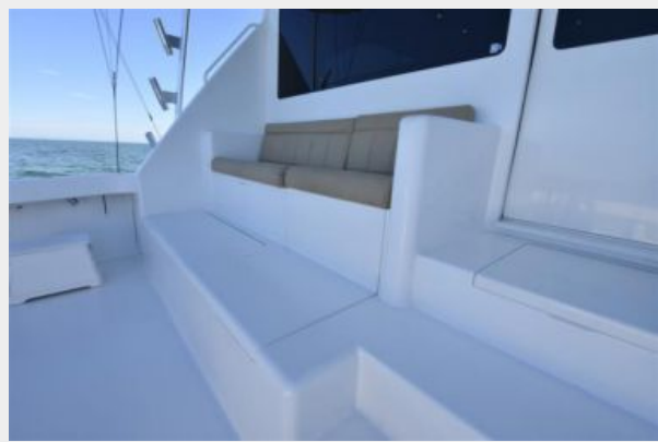
2004 61 Viking Cockpit