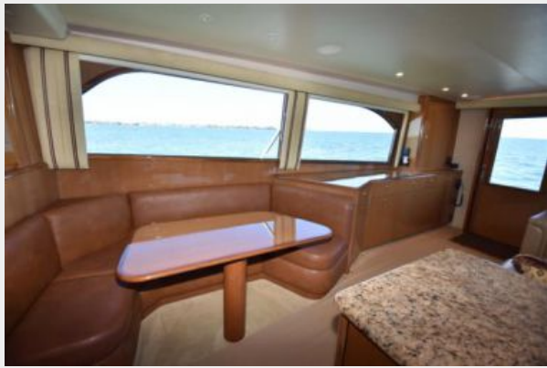
2004 61 Viking Dinette