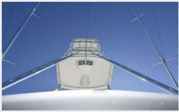
2004 61 Viking Helm