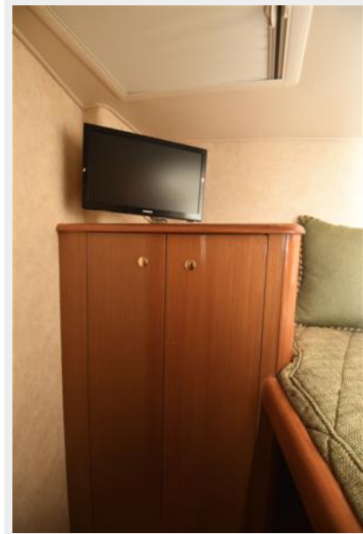
2004 61 Viking Bunk