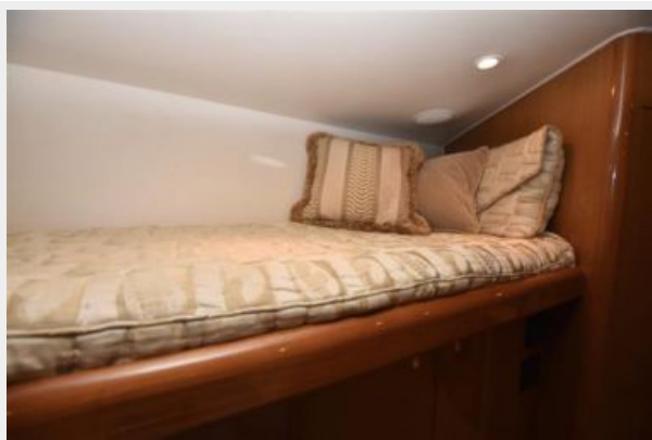
2004 61 Viking Forward