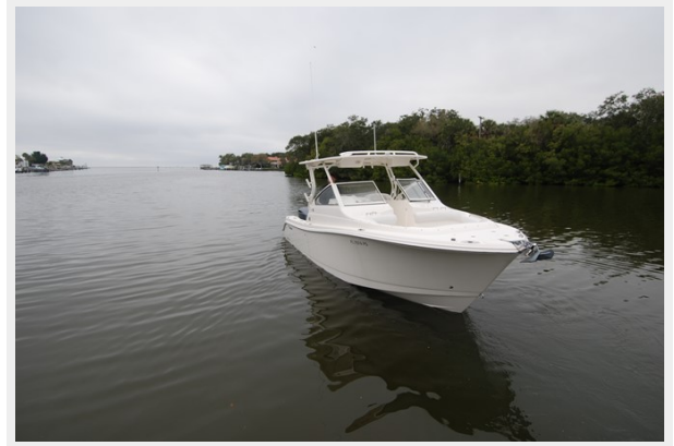
Strb Bow On