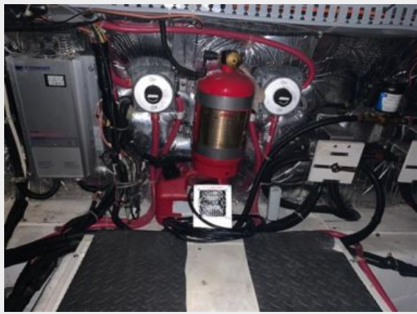
55 Summer Place 2000 Carver 406 Engine Room 4