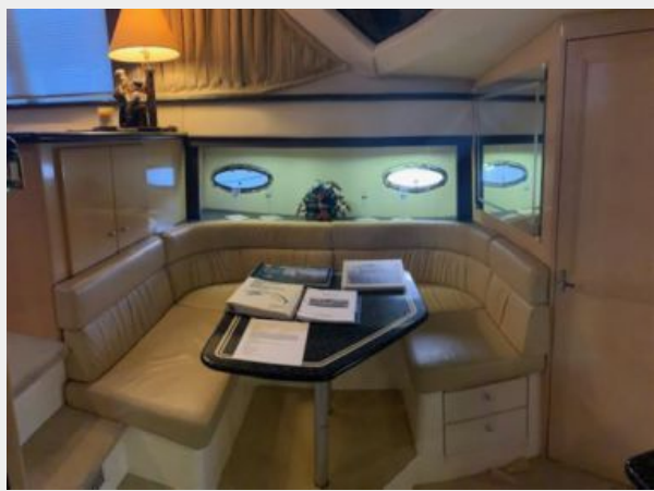
35 Summer Place 2000 Carver 406 Dinette 2JPG