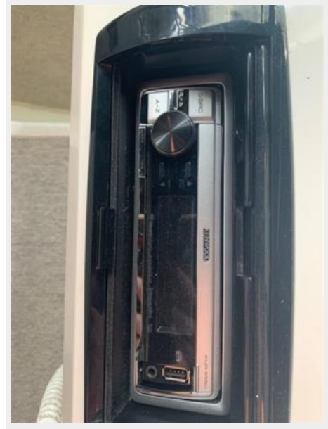
24 Summer Place 2000 Carver 406 helm 6