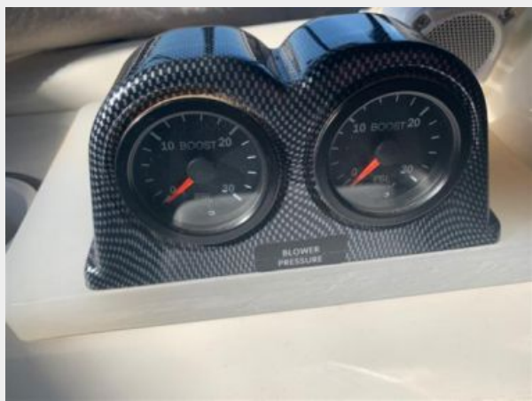
26 Summer Place 2000 Carver 406 Helm 8