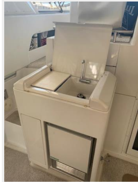
14 Summer Place 2000 Carver 406 aft deck wet bar