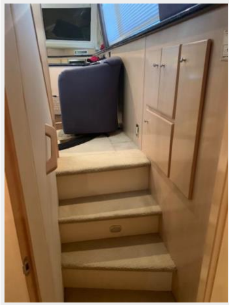
52 Summer Place 2000 Carver 406 aft companionway 2