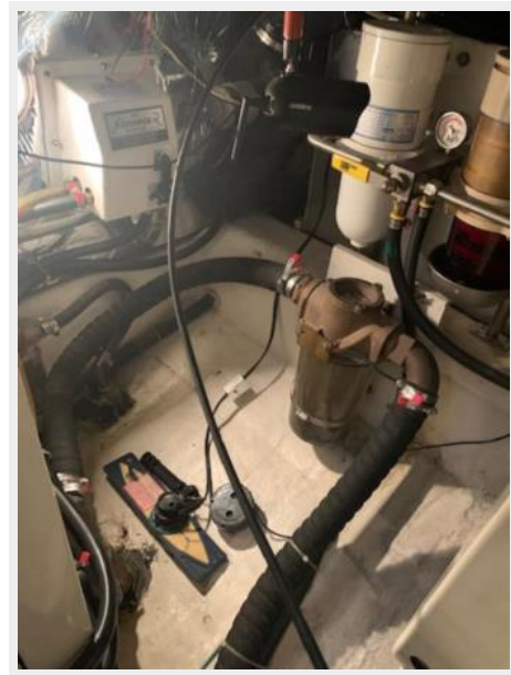
56 Summer Place 2000 Carver 406 Engine room 4