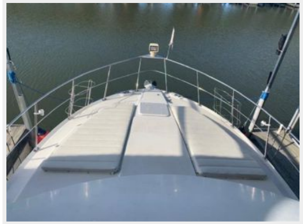
11.1 Summer Place 2000 Carver 406 Forward Deck 2