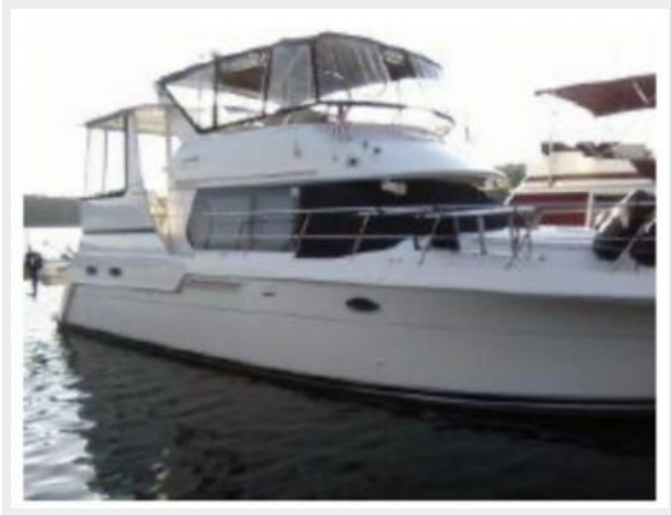
2 Summer Place 2000 Carver 406 Starboard View