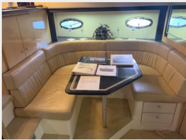
36 Summer Place 2000 Carver 406 Dinette 3