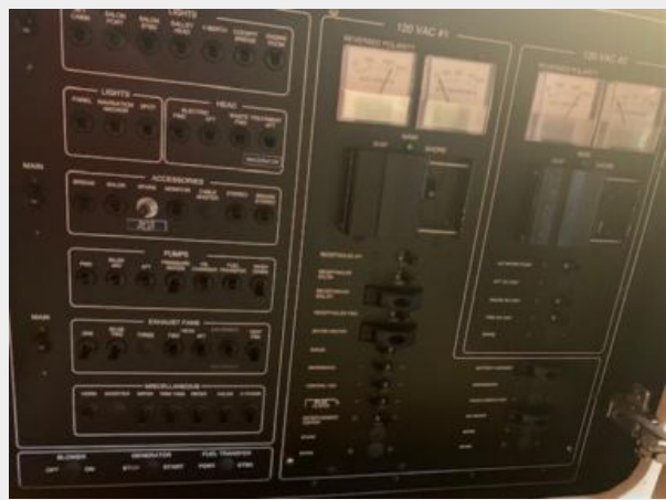
62 Summer Place 2000 Carver 406 electrical panel 1