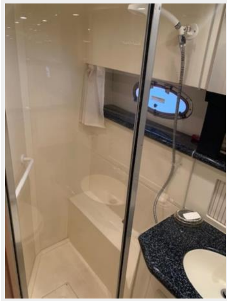
50 Summer Place 2000 Carver 406 Aft Head 2