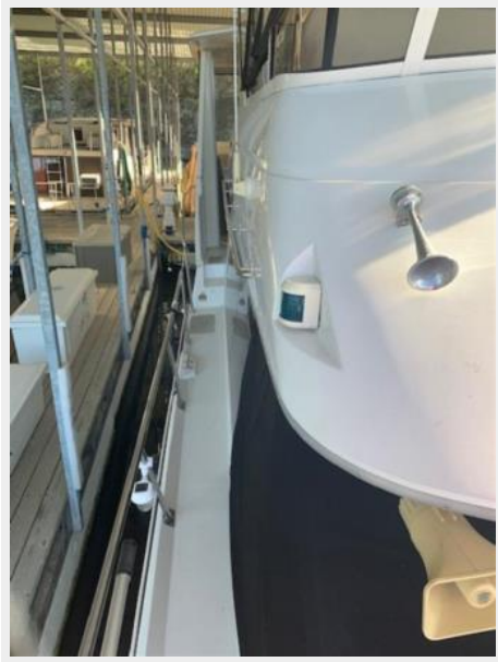
10 Summer Place 2000 Carver 406 Starboard Catwalk