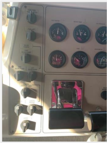
20 Summer Place 2000 Carver 406 Helm 6