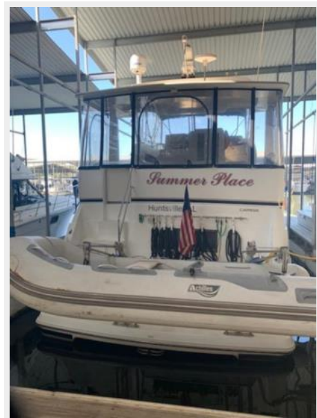
3 Summer Place 2000 Carver 406 Aft View 1