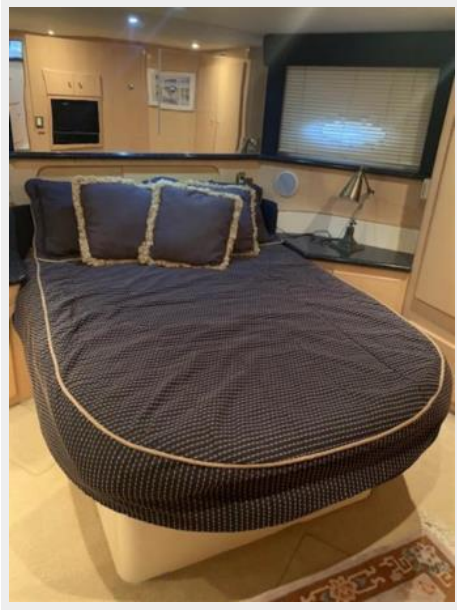
44 Summer Place 2000 Carver 406 Aft cabin 5