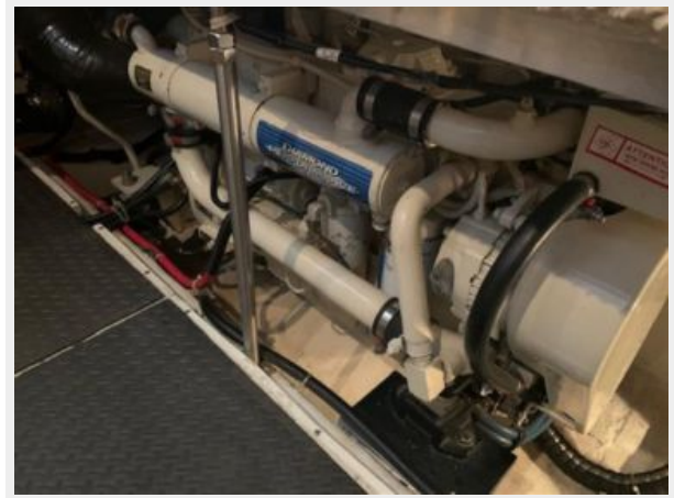
58 Summer Place 2000 Carver 406 Engine Room 6