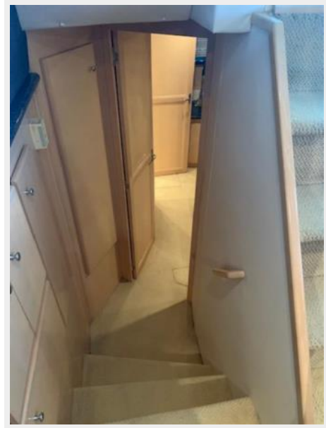
43 Summer Place 2000 Carver 406 Aft Cabin companionway