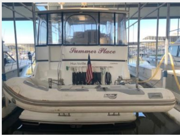
64.1 Summer Place 2000 Carver 406 Aft View 2