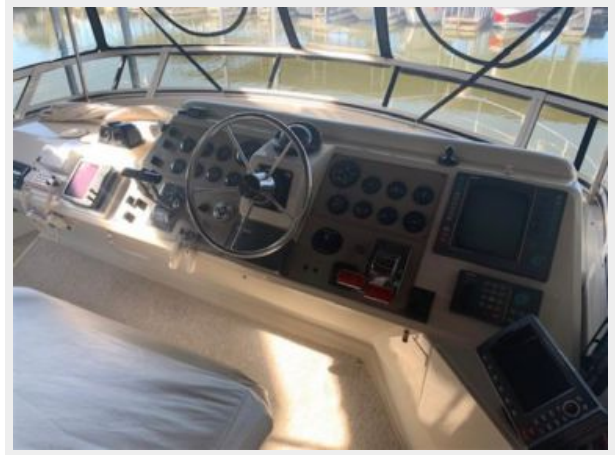
19 Summer Place 2000 Carver 406 Helm 1