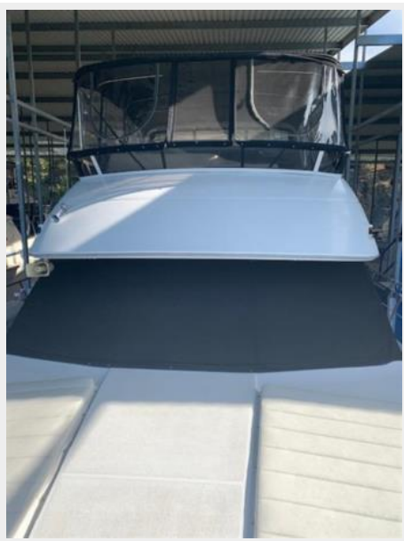
11.2 Summer Place 2000 Carver 406 Forward View