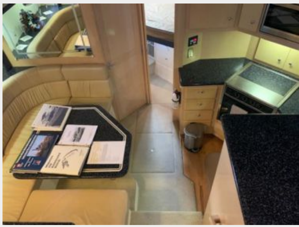
34 Summer Place 2000 Carver 406 Galley and Dinette