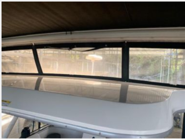
28 Summer Place 2000 Carver 406 Aft Hardtop