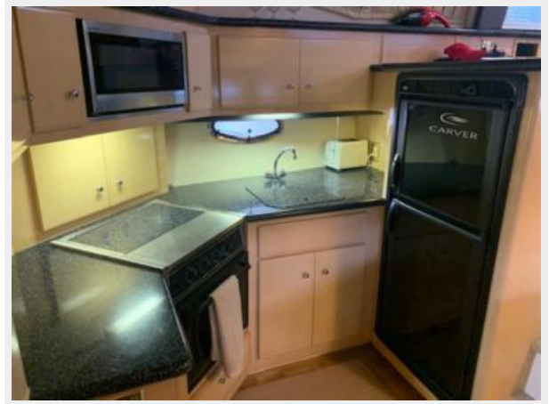
37 Summer Place 2000 Carver 406 Galley 2