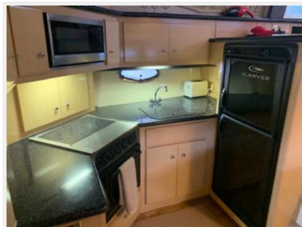
37 Summer Place 2000 Carver 406 Galley 2