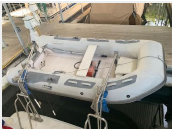
64.1 Summer Place 2000 Carver 406 Aft View 2