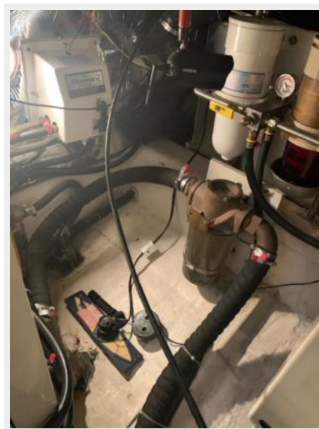
56 Summer Place 2000 Carver 406 Engine room 4