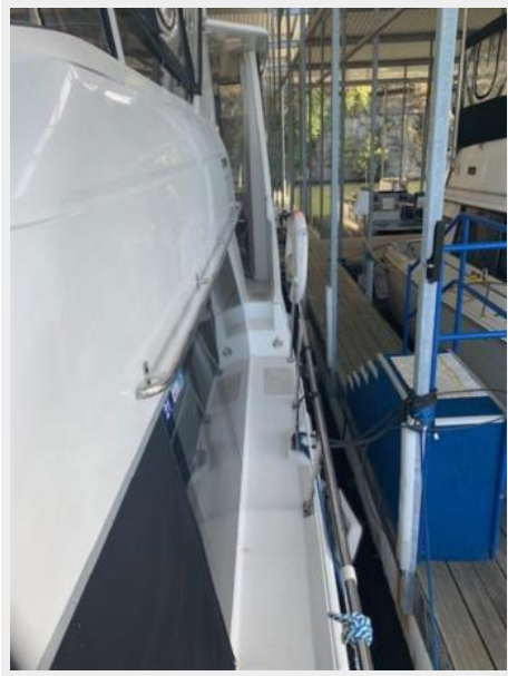
9 Summer Place 2000 Carver 406 Port Catwalk