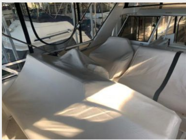
18 Summer Place 2000 Carver 406 Flybridge 2