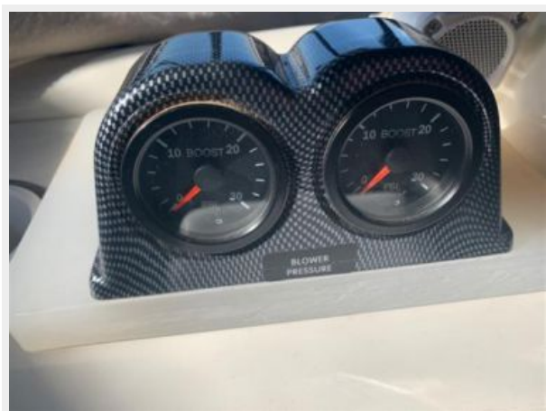
26 Summer Place 2000 Carver 406 Helm 8