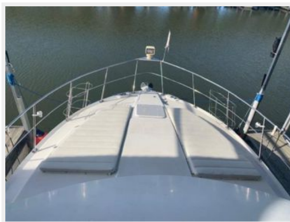
11.1 Summer Place 2000 Carver 406 Forward Deck 2