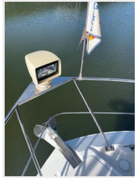
11 Summer Place 2000 Carver 406 Spotlight