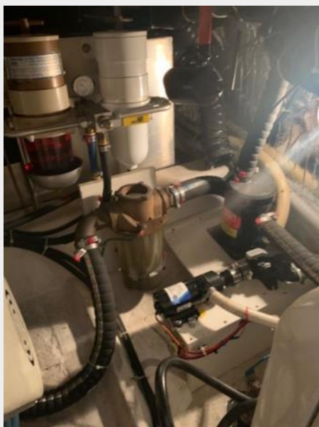
54 Summer Place 2000 Carver 406 Engine room 3