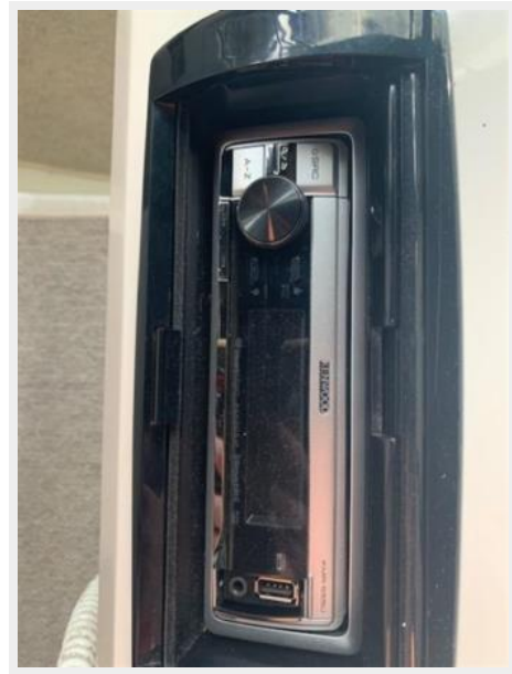
24 Summer Place 2000 Carver 406 helm 6