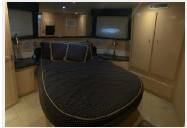
47 Summer Place 2000 Carver 406 Aft Cabin 2