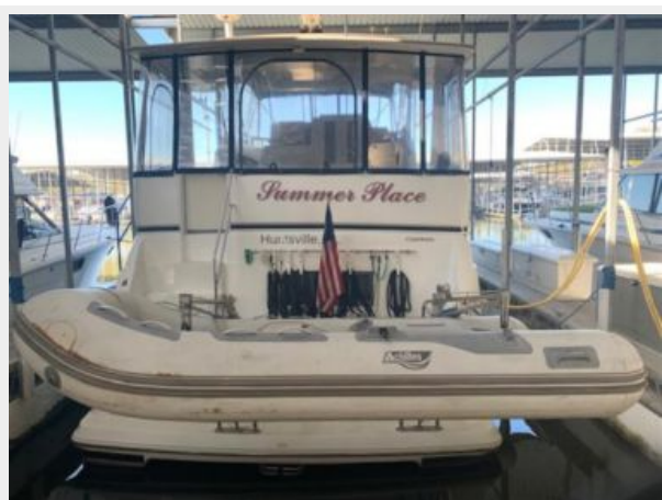
64.1 Summer Place 2000 Carver 406 Aft View 2