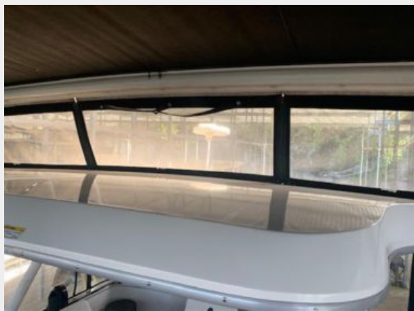
28 Summer Place 2000 Carver 406 Aft Hardtop