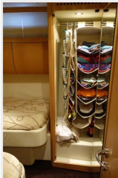
Twin guest closet