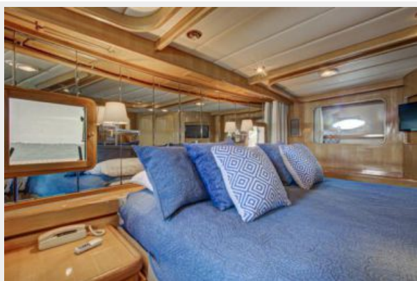
Happy Days (10)