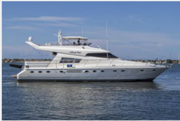
Happy Days R