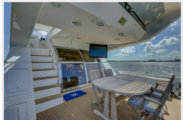
Happy Days (19)