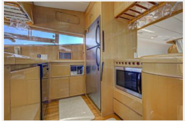
Happy Days (36)