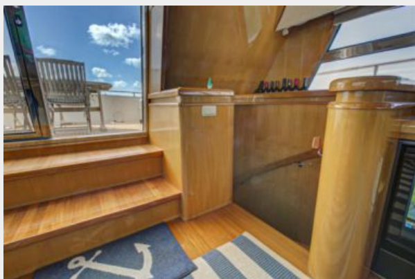
Happy Days (2)