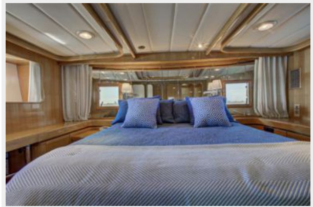
Happy Days (12)