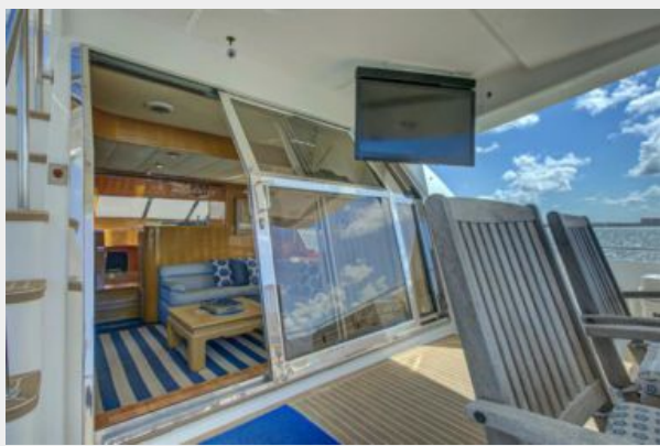
Happy Days (22)