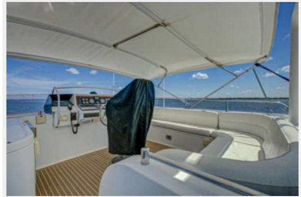
Happy Days (60)