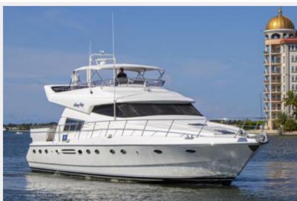
Happy Days A