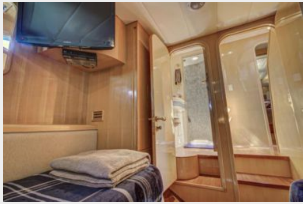
Happy Days (49)