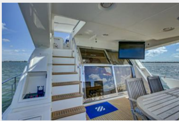
Happy Days (16)