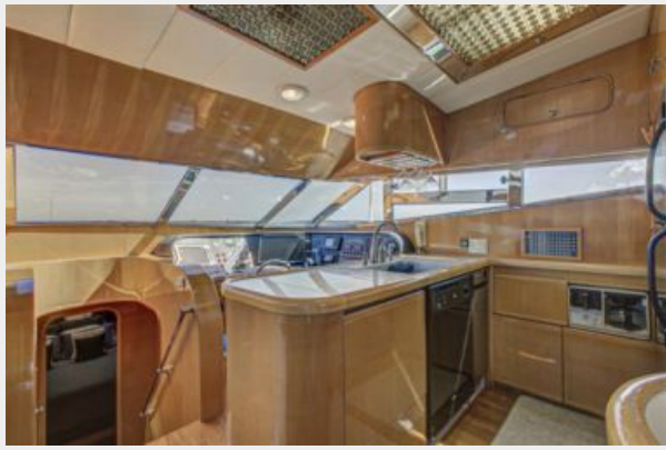
Happy Days (34)