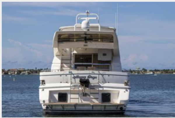
Happy Days K