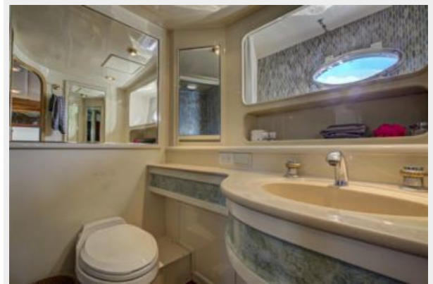
Happy Days (8)