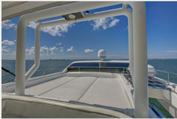
Happy Days (66)