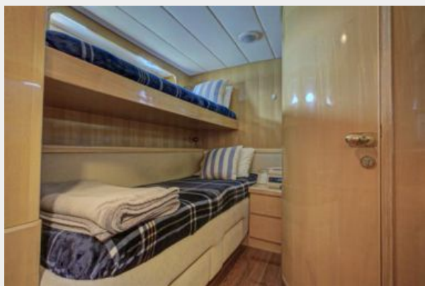
Happy Days (53)