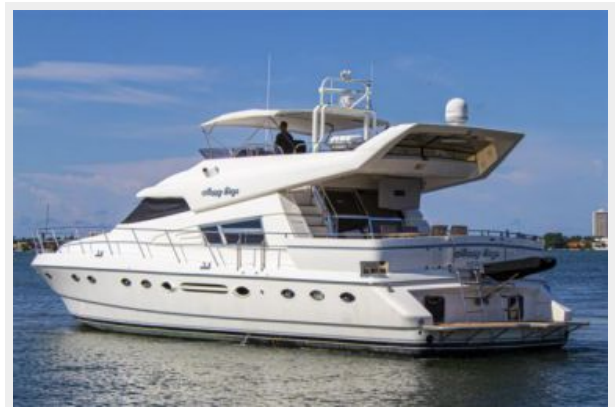
Happy Days H