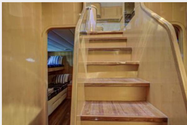
Happy Days (51)