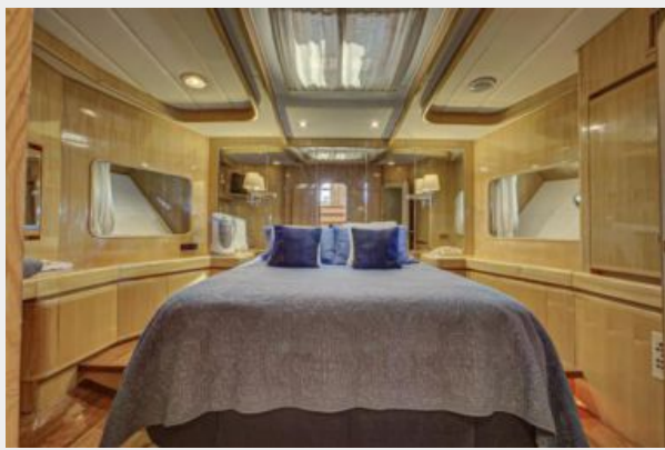
Happy Days (41)