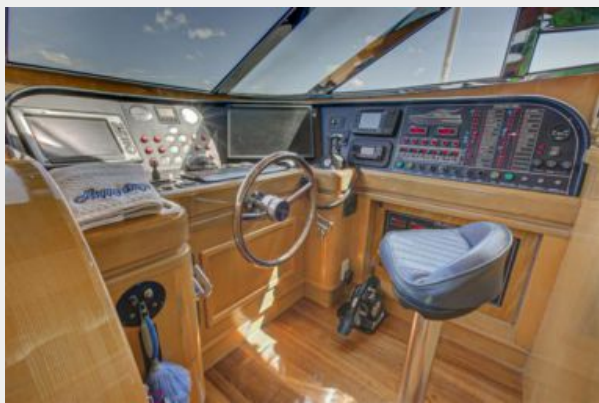
Happy Days (37)