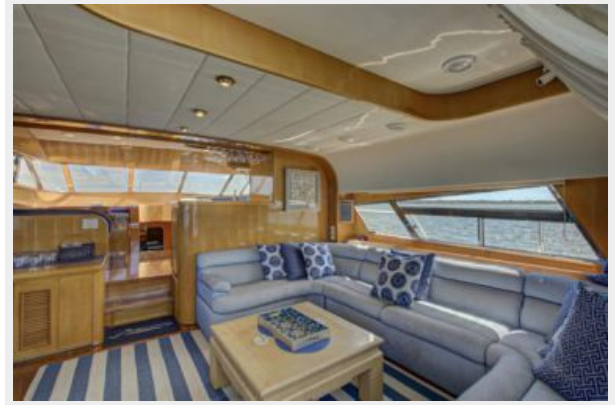
Happy Days (25)