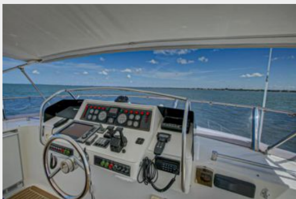
Happy Days (64)