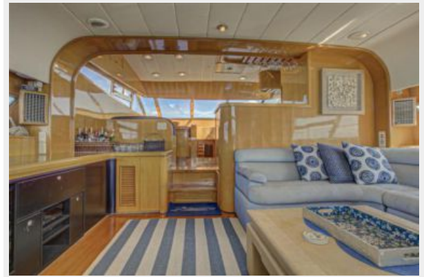
Happy Days (29)