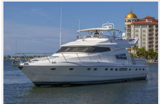
Happy Days D