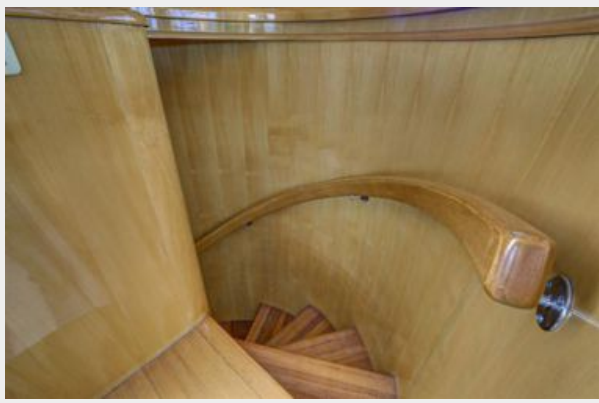
Happy Days (3)