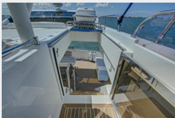
Happy Days (59)