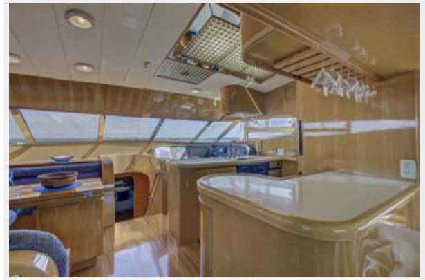
Happy Days (32)