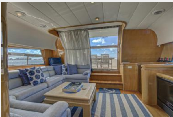
Happy Days (30)