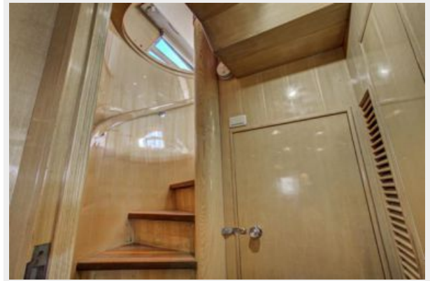
Happy Days (13)