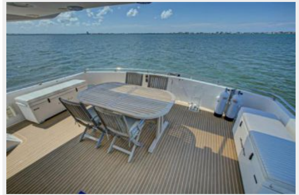
Happy Days (71)