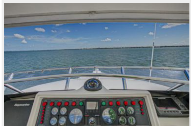
Happy Days (69)