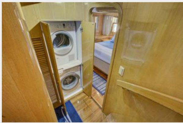
Happy Days (4)