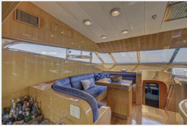
Happy Days (33)