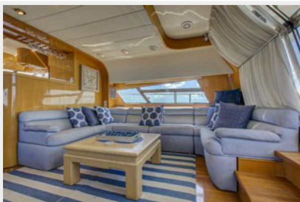
Happy Days (27)