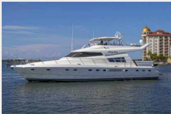
Happy Days E