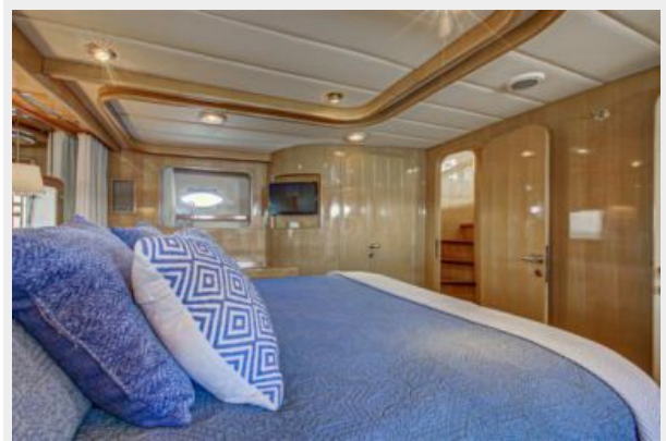
Happy Days (11)