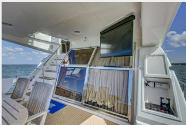
Happy Days (15)