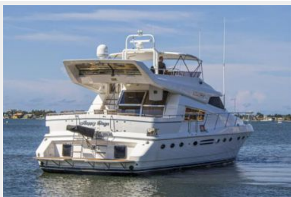
Happy Days M