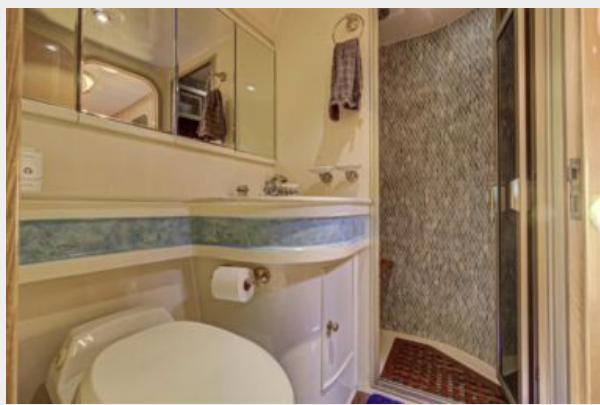
Happy Days (50)