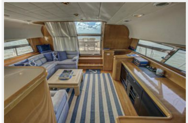
Happy Days (56)