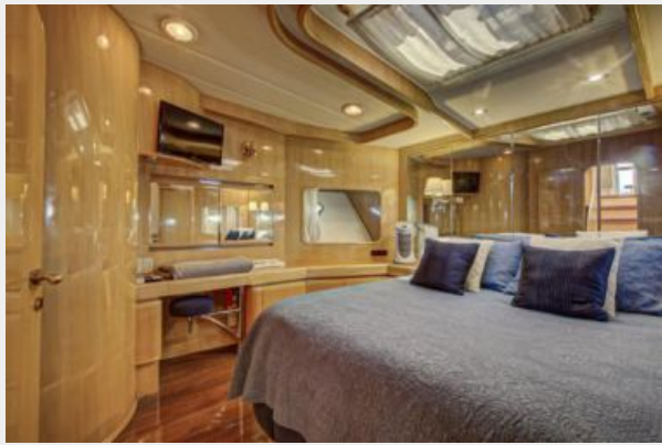
Happy Days (43)