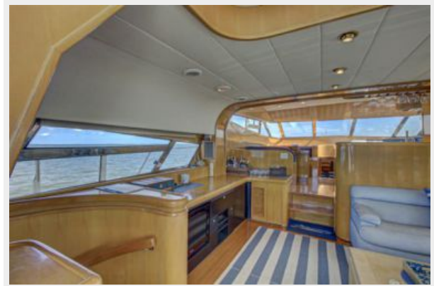
Happy Days (26)