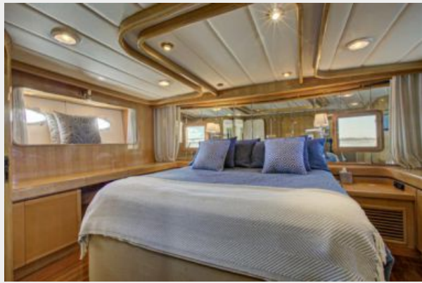
Happy Days (6)