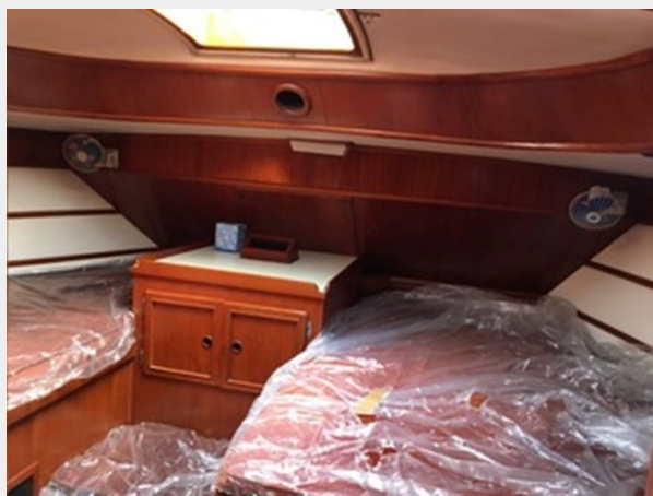
Aft cabin with a double and a single berth