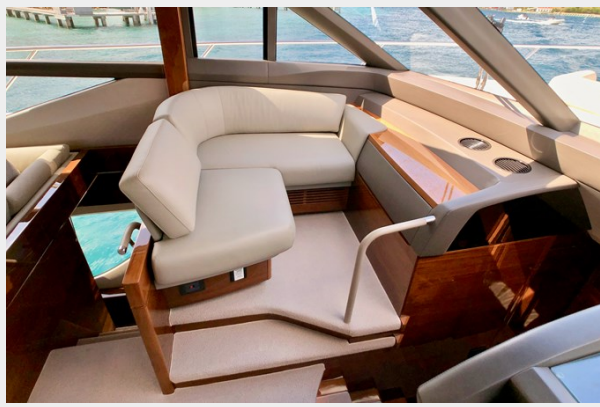
2019 Princess 70 Flybridge Helm Station companion Seating