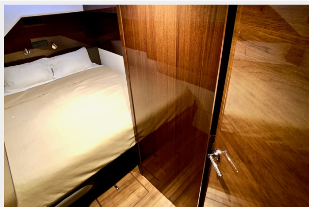
2019 Princess 70 Flybridge Crew Cabin