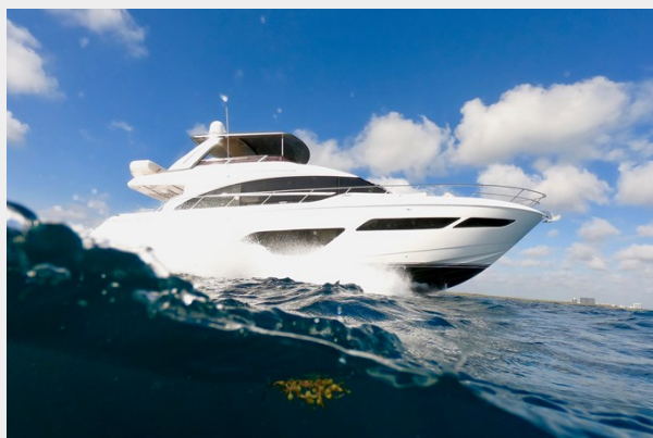
2019 Princess 70 Flybridge Starboard Profile