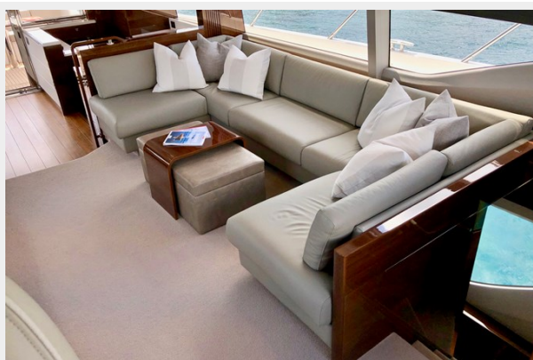
2019 Princess 70 Flybridge Salon