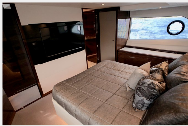
2019 Princess 70 Flybridge Master Stateroom