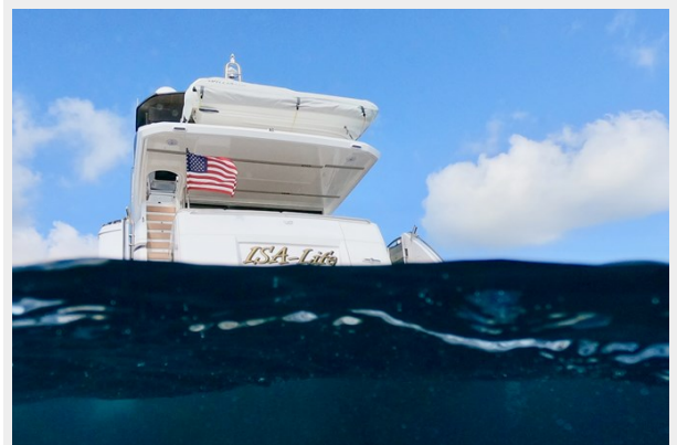
2019 Princess 70 Flybridge Starboard Transom