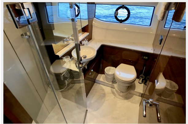
Starboard Guest Head