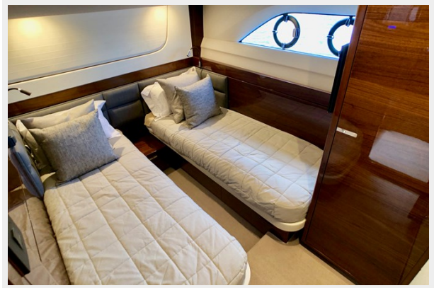
2019 Princess 70 Flybridge Port Guest Stateroom