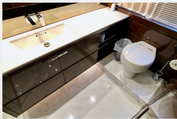
2019 Princess 70 Flybridge Master Head