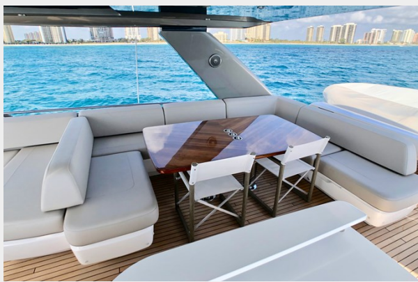
2019 Princess 70 Flybridge