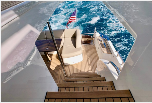
2019 Princess 70 Flybridge Stairwell