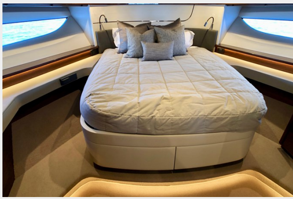
2019 Princess 70 Flybridge Foward Guest Stateroom