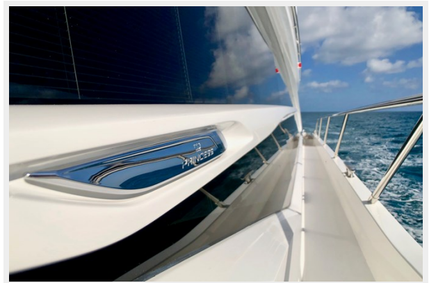
2019 Princess 70 Flybridge Walk Around