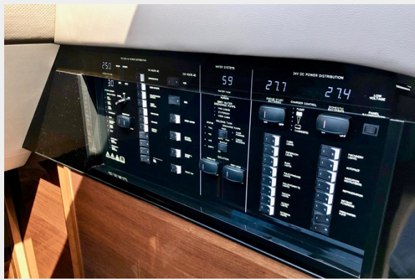
2019 Princess 70 Flybridge Breaker Panel