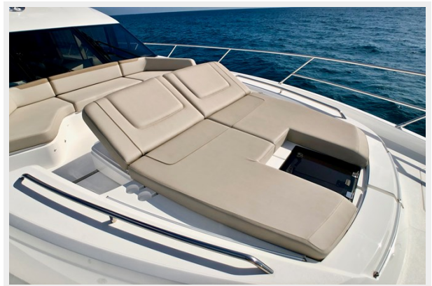
2019 Princess 70 Flybridge Sunpad