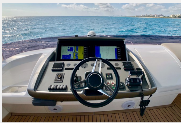
2019 Princess 70 Flybridge Helm