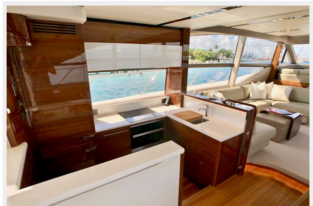
2019 Princess 70 Flybridge Galley