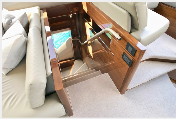
2019 Princess 70 Flybridge Stairwell