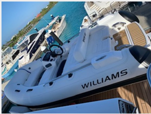
2019 Princess 70 Flybridge Tender