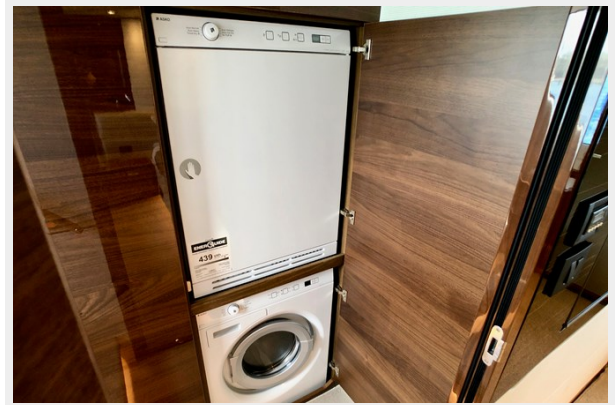
2019 Princess 70 Flybridge Laundry