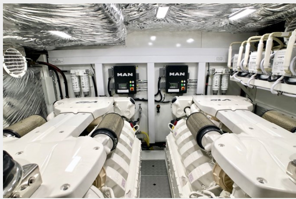
2019 Princess 70 Flybridge Engine Room