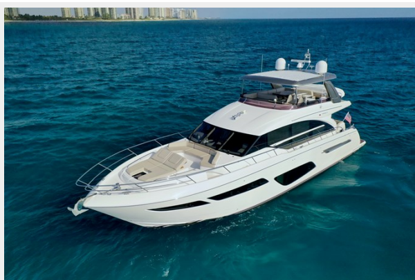
2019 Princess 70 Flybridge Bow