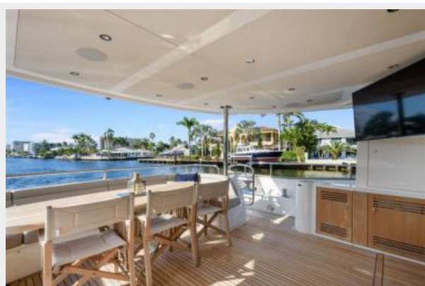
13_2017 95ft Sunseeker Yacht NITSA