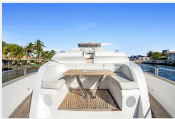
5_2017 95ft Sunseeker Yacht NITSA