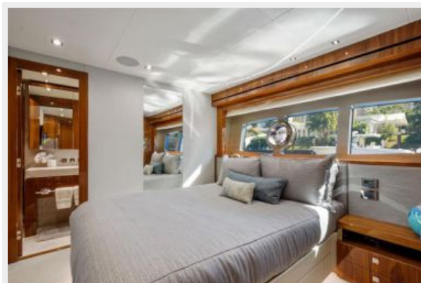
34_2017 95ft Sunseeker Yacht NITSA