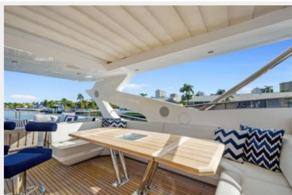
9_2017 95ft Sunseeker Yacht NITSA