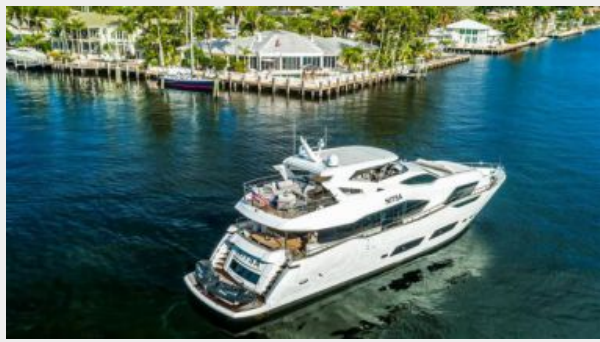
3_2017 95ft Sunseeker Yacht NITSA