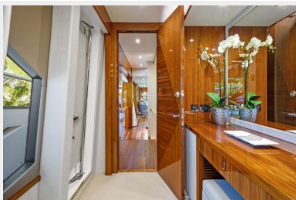
25_2017 95ft Sunseeker Yacht NITSA