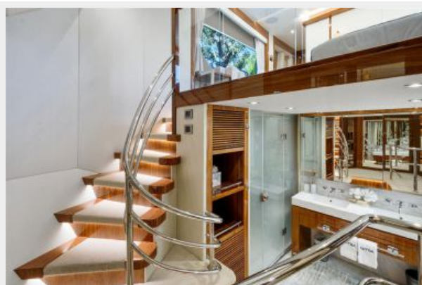
31_2017 95ft Sunseeker Yacht NITSA