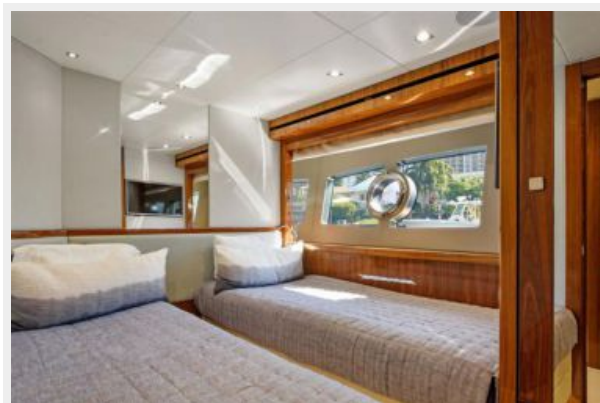
40_2017 95ft Sunseeker Yacht NITSA