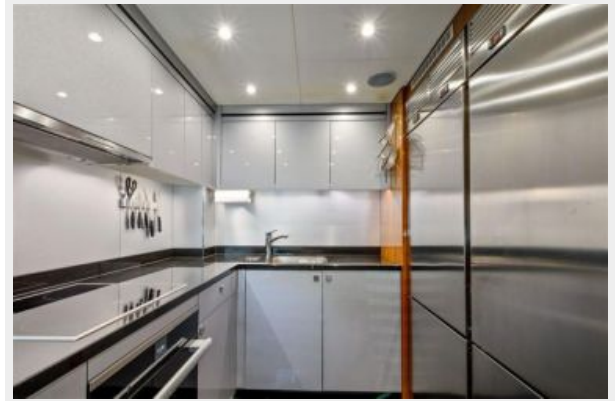
22_2017 95ft Sunseeker Yacht NITSA