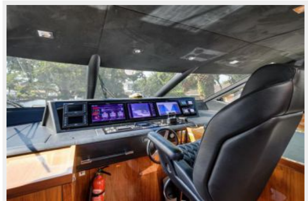
24_2017 95ft Sunseeker Yacht NITSA