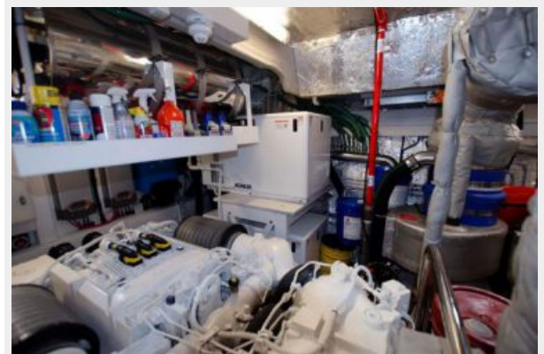
53_2017 95ft Sunseeker Yacht NITSA