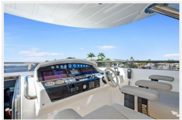
6_2017 95ft Sunseeker Yacht NITSA