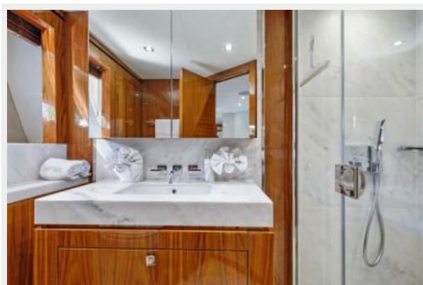
41_2017 95ft Sunseeker Yacht NITSA