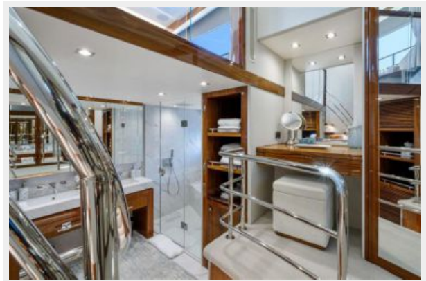
30_2017 95ft Sunseeker Yacht NITSA