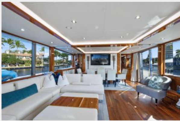
15_2017 95ft Sunseeker Yacht NITSA