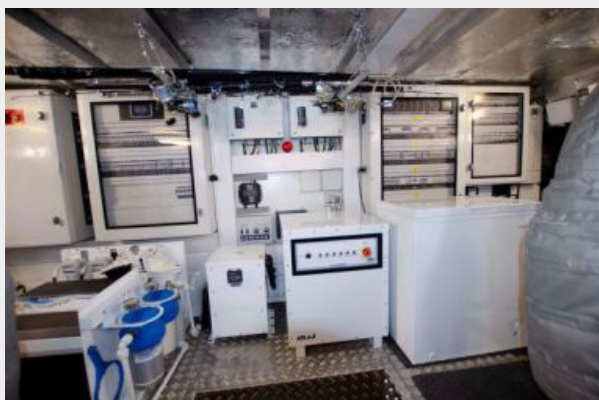
52_2017 95ft Sunseeker Yacht NITSA