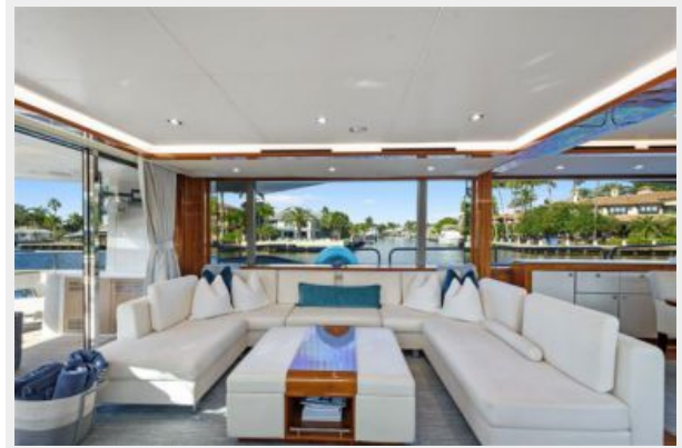
16_2017 95ft Sunseeker Yacht NITSA