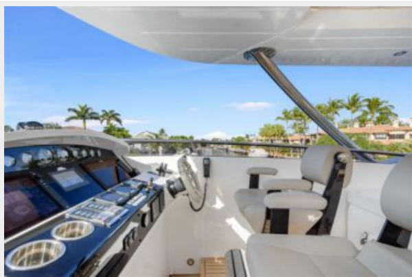
7_2017 95ft Sunseeker Yacht NITSA