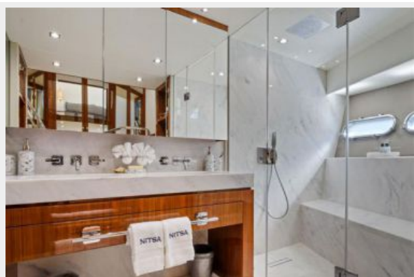
33_2017 95ft Sunseeker Yacht NITSA