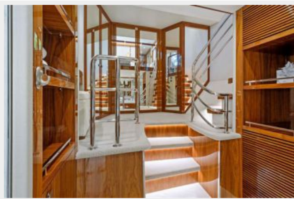
29_2017 95ft Sunseeker Yacht NITSA