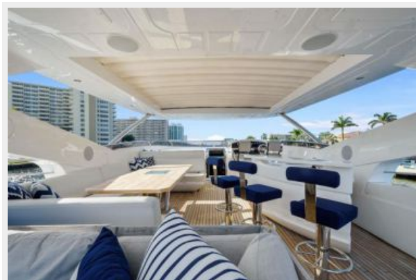
10_2017 95ft Sunseeker Yacht NITSA