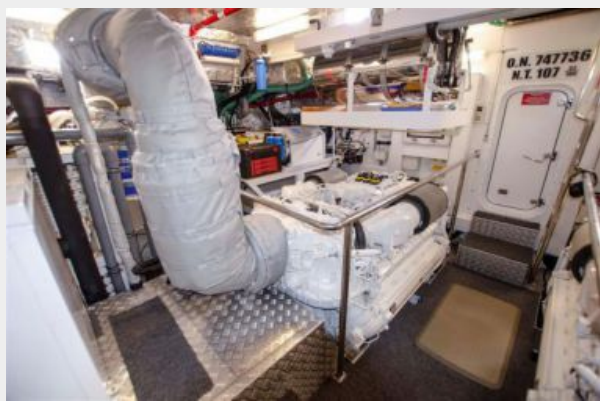
50_2017 95ft Sunseeker Yacht NITSA