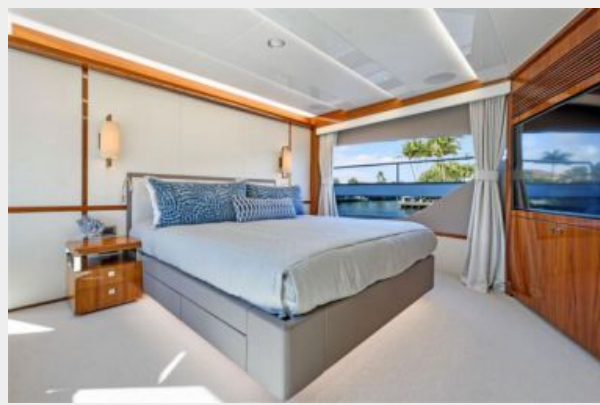
27_2017 95ft Sunseeker Yacht NITSA