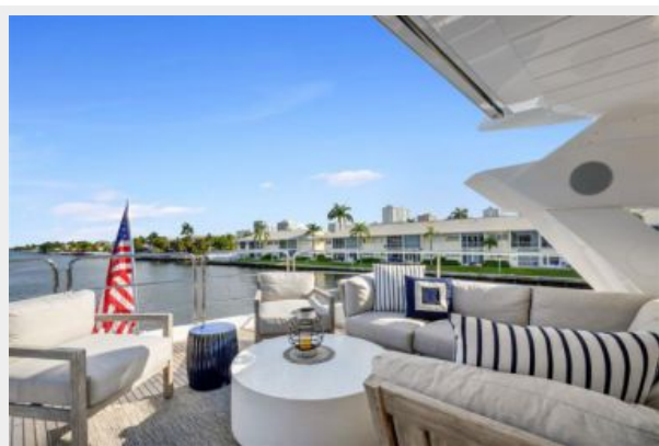
11_2017 95ft Sunseeker Yacht NITSA