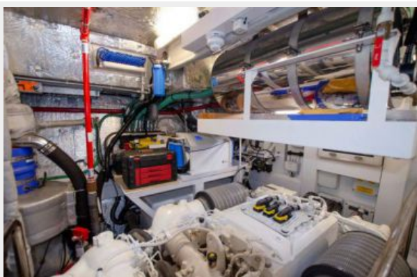
54_2017 95ft Sunseeker Yacht NITSA