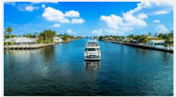
4_2017 95ft Sunseeker Yacht NITSA