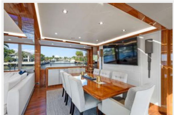
18_2017 95ft Sunseeker Yacht NITSA