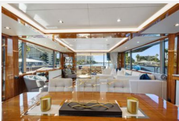
19_2017 95ft Sunseeker Yacht NITSA