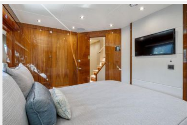
35_2017 95ft Sunseeker Yacht NITSA