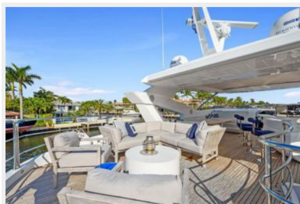
12_2017 95ft Sunseeker Yacht NITSA