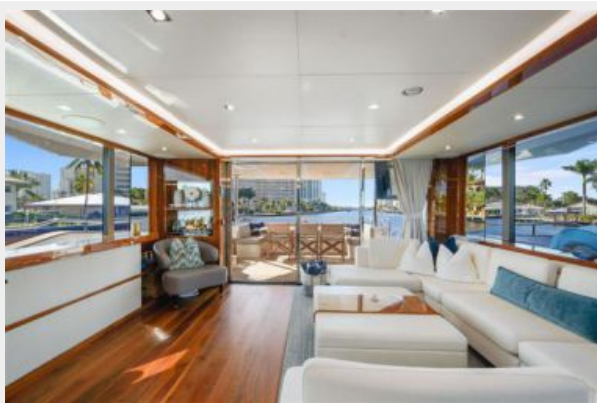
17_2017 95ft Sunseeker Yacht NITSA