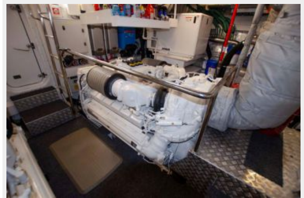
51_2017 95ft Sunseeker Yacht NITSA