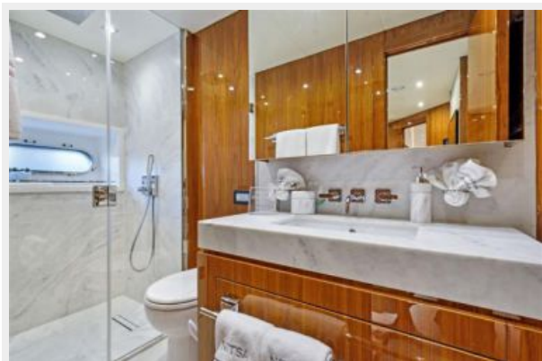
39_2017 95ft Sunseeker Yacht NITSA