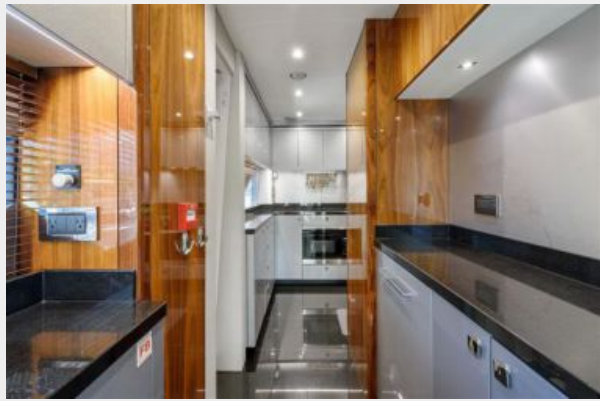
21_2017 95ft Sunseeker Yacht NITSA