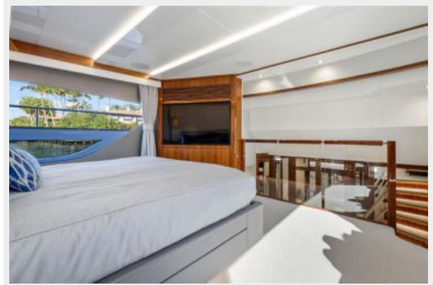
28_2017 95ft Sunseeker Yacht NITSA