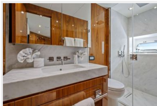
36_2017 95ft Sunseeker Yacht NITSA