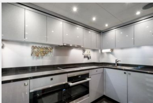
23_2017 95ft Sunseeker Yacht NITSA