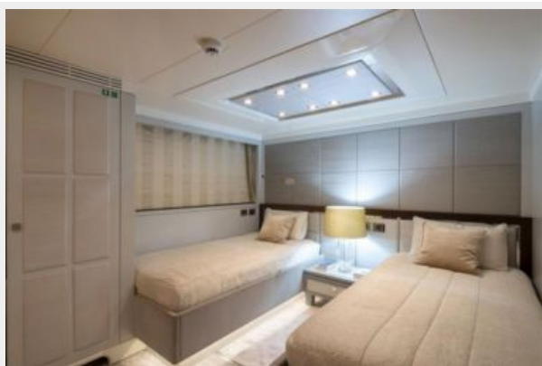
Twin Guest Cabin Port