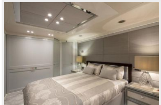
Guest Double Cabin 1