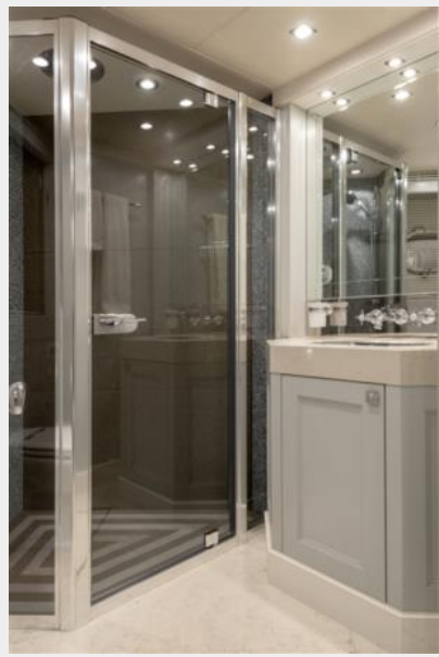
Guest Cabin Ensuite