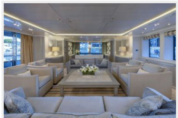
Main Salon Seating