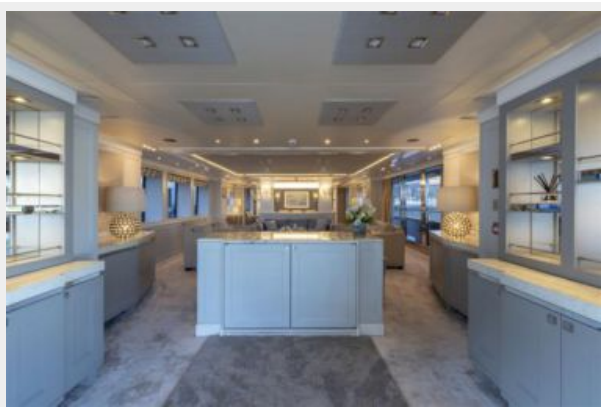
Main Salon Entry