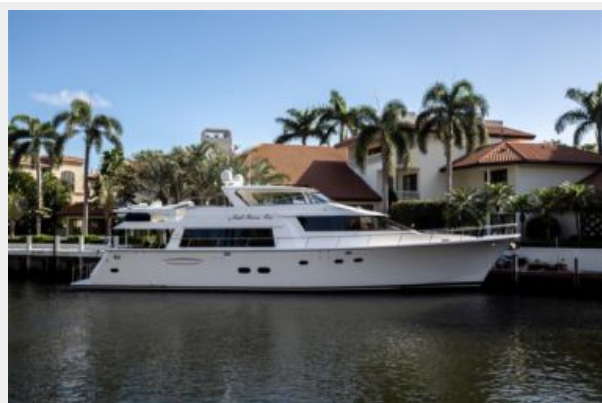
2008 85' Pacific Mariner profile starboard