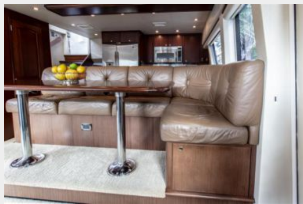
2008 85' Pacific Mariner L seating