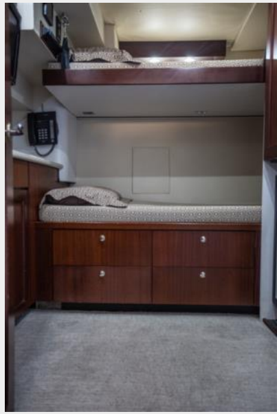
2008 85' Pacific Mariner crew cabin bunks