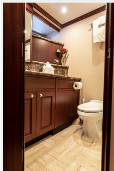
2008 85' Pacific Mariner guest head