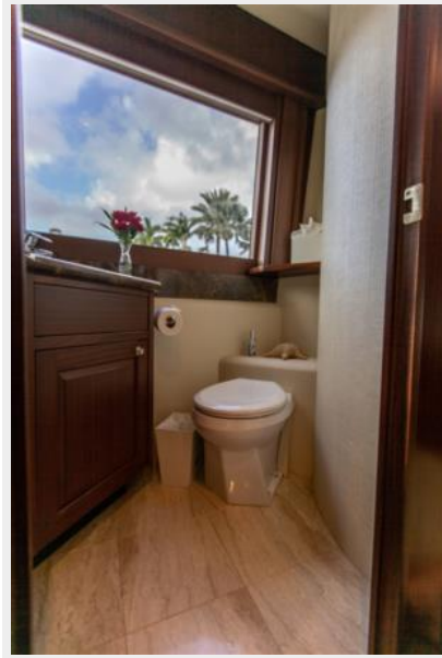
2008 85' Pacific Mariner day head