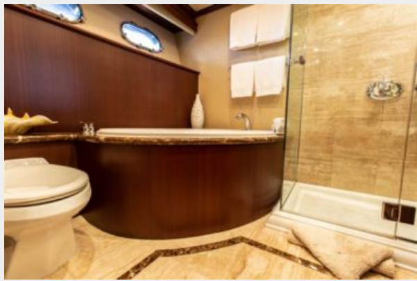
2008 85' Pacific Mariner owners bathroom