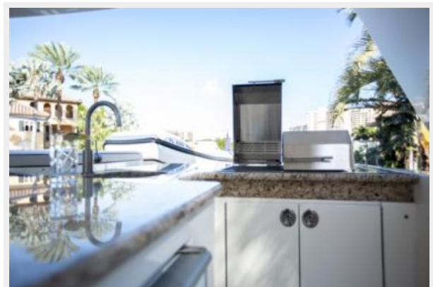
2008 85' Pacific Mariner Foredeck sundeck bar