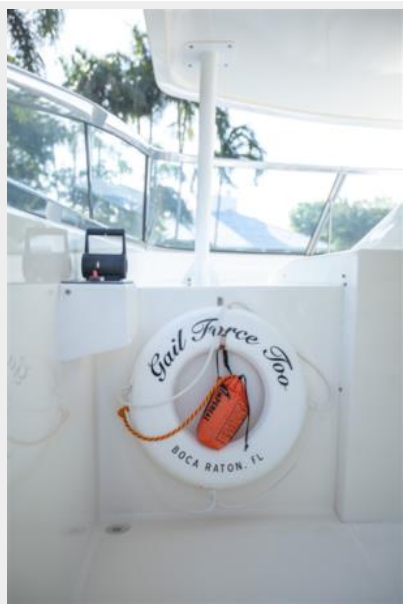
2008 85' Pacific Mariner life ring detail shot