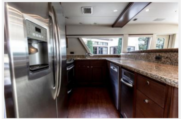
2008 85' Pacific Mariner galley