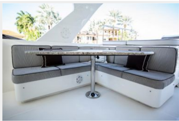
2008 85' Pacific Mariner Foredeck sundeck table