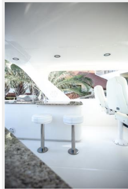
2008 85' Pacific Mariner Foredeck sundeck bar