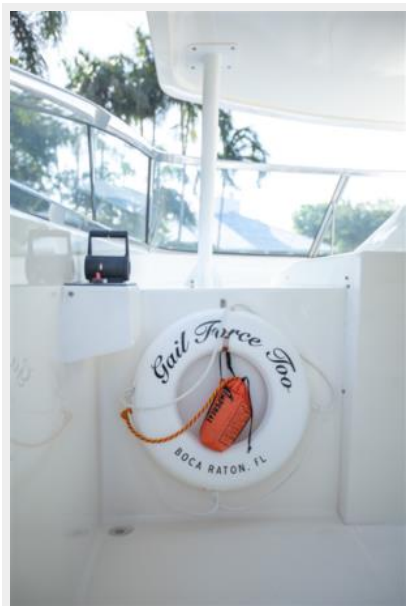
2008 85' Pacific Mariner life ring detail shot