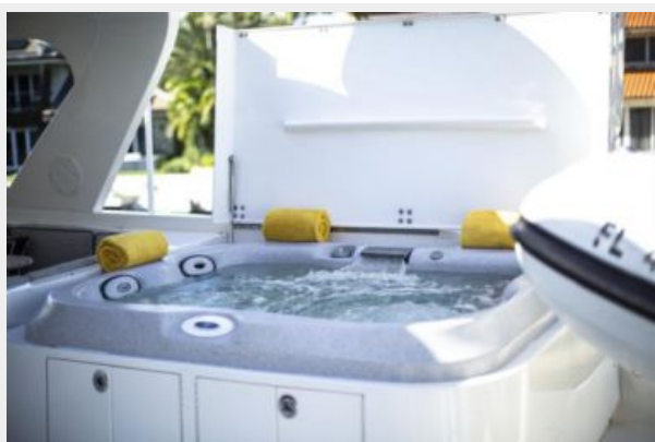
2008 85' Pacific Mariner Foredeck jacuzzi