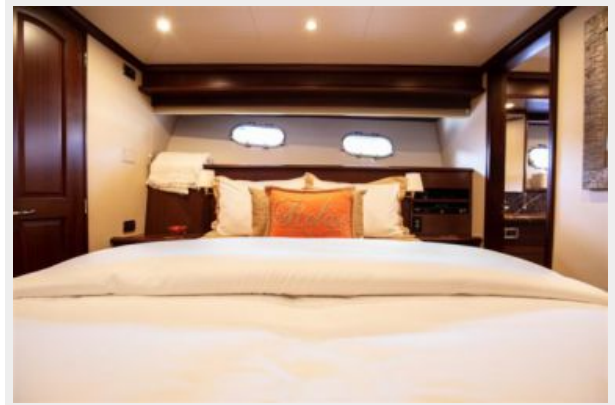
2008 85' Pacific Mariner guest cabin double