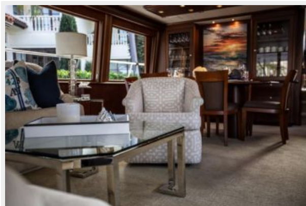
2008 85' Pacific Mariner main salon