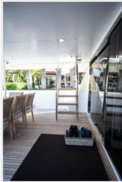
2008 85' Pacific Mariner aft deck