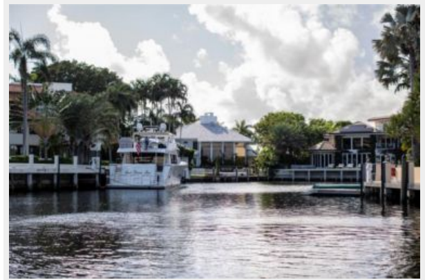
2008 85' Pacific Mariner aft deck