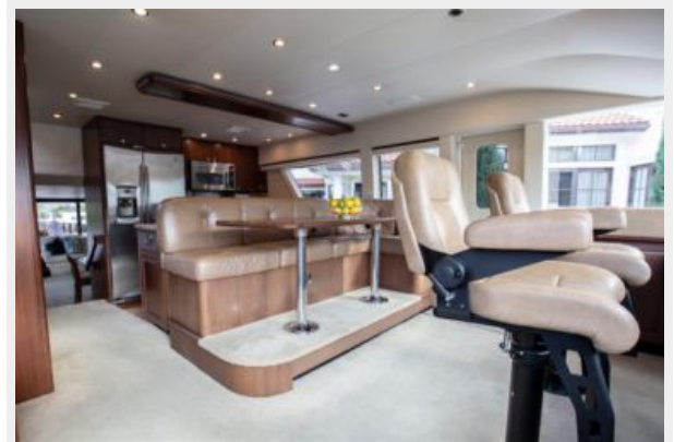
2008 85' Pacific Mariner pilothouse