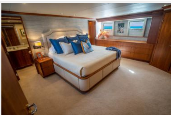
VIP Stateroom, Forward