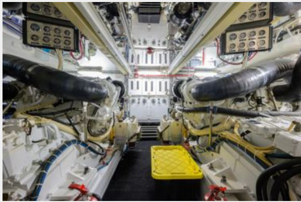
Instigator_Engine Room1 - Copy