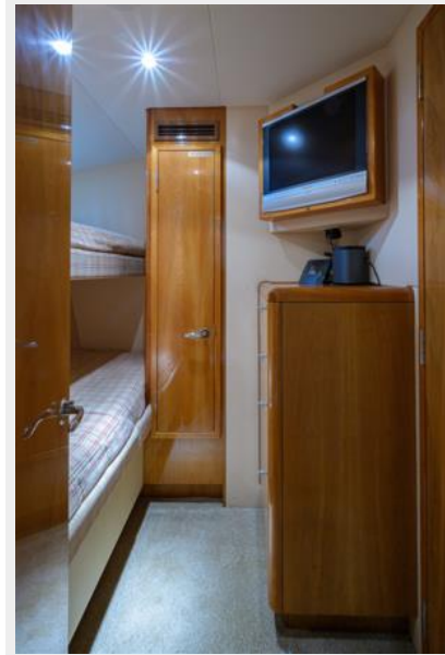
Instigator_Port Guest Stateroom2