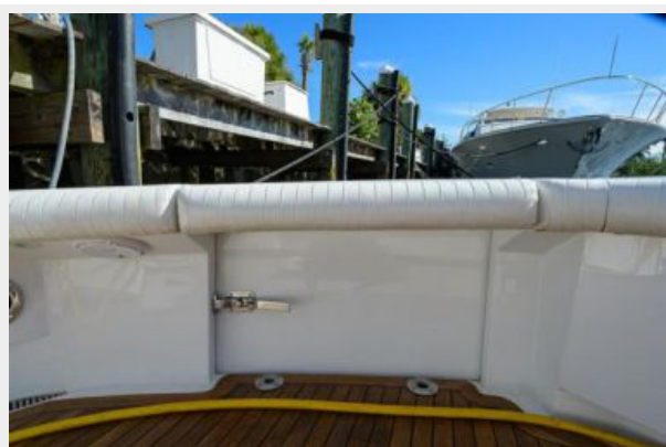
Instigator_Cockpit12 - Copy