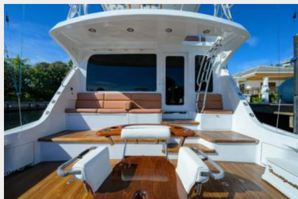
Instigator_Cockpit4 - Copy