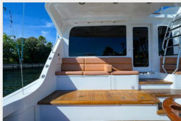
Instigator_Cockpit9 - Copy