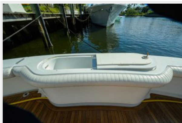
Instigator_Cockpit11 - Copy