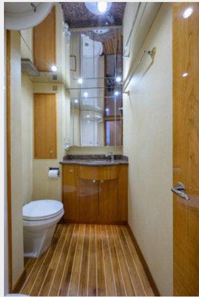
Instigator_Port Guest Head2