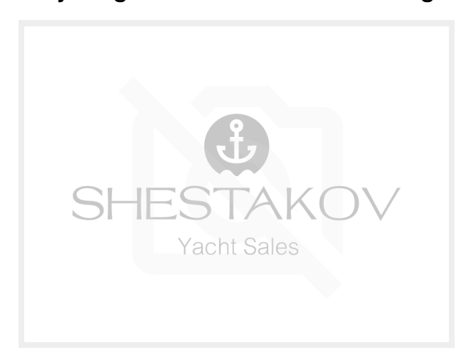
BELLA GIORNATA 94' Lazzara 2000/2018 Flybridge Motor Yacht: Aft Deck