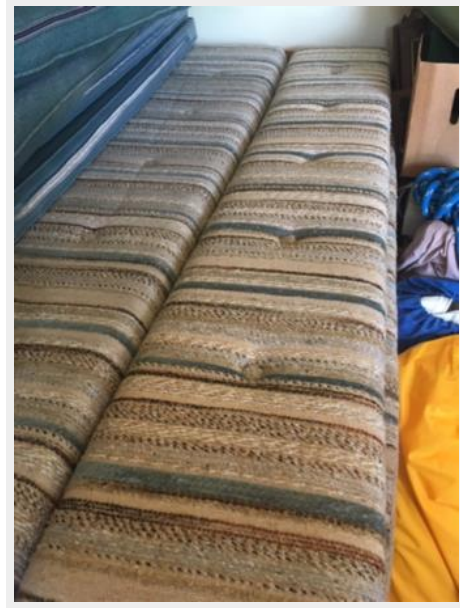
Cusions main cabin