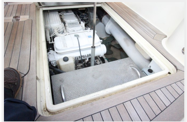
Starboard Engine Room