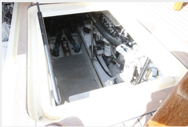
Center Engine Room Access