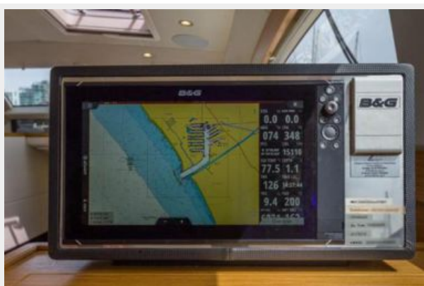
12' B&G at Navigation Station