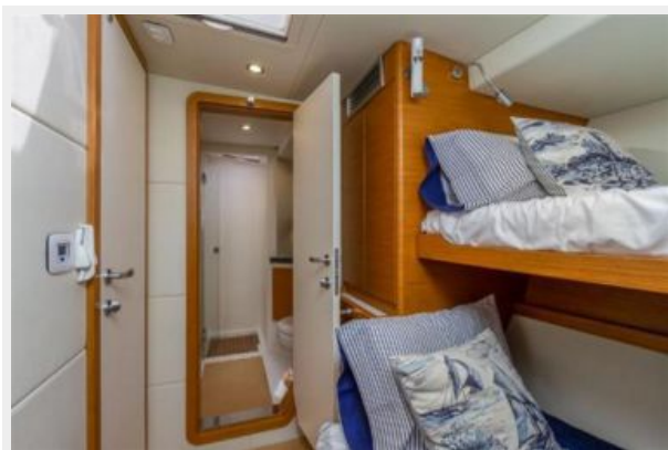
STBD Guest Cabin