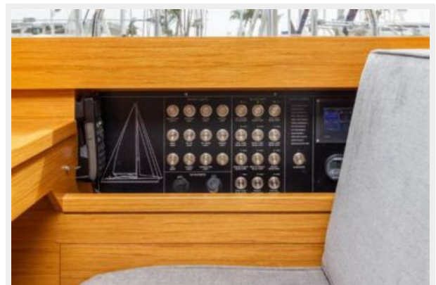
Navigation Station Electrical Panel and Auto Pilot / Engine Controls