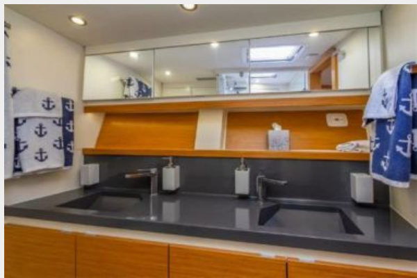
His and Hers Master Vanities