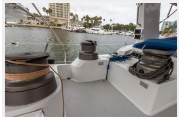
Push Button Electric Winches