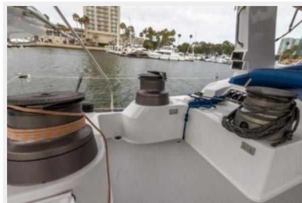
Push Button Electric Winches