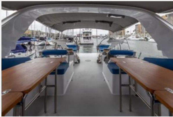
Guest Cockpit Looking Aft