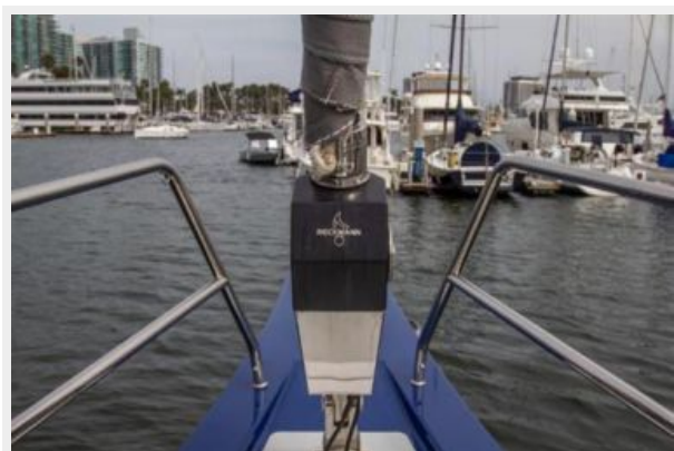
Reckman Electric Roller Furler