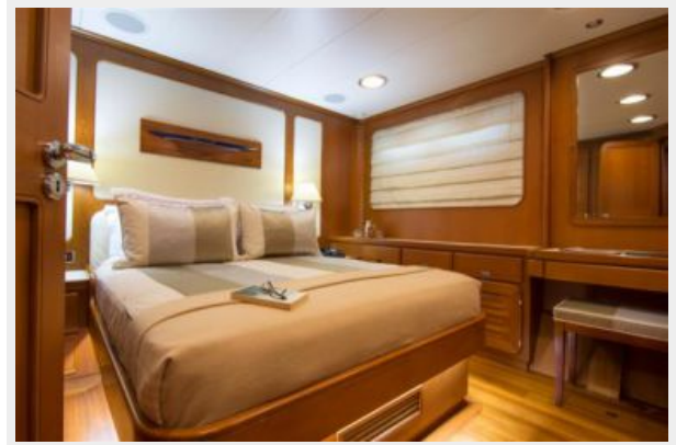
ANTARA - Perini Navi 46 meter (30)