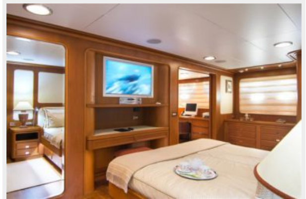
ANTARA - Perini Navi 46 meter (26)