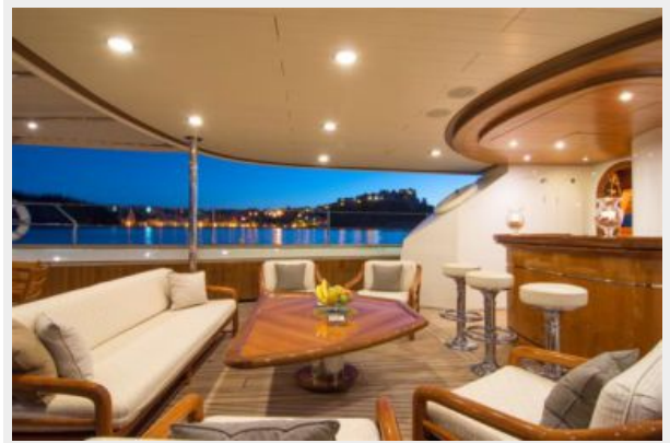
ANTARA - Perini Navi 46 meter (20)