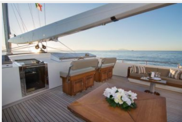
ANTARA - Perini Navi 46 meter (15)