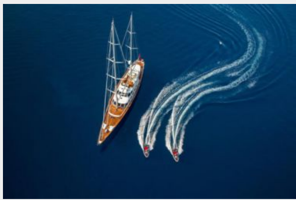
ANTARA - Perini Navi 46 meter (1)