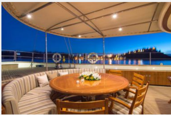
ANTARA - Perini Navi 46 meter (19)