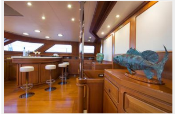
ANTARA - Perini Navi 46 meter (24)