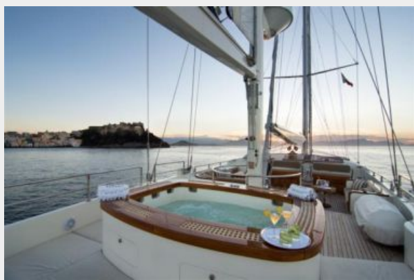
ANTARA - Perini Navi 46 meter (13)