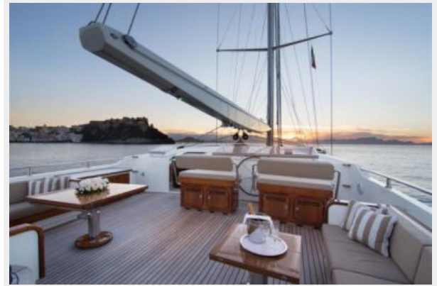
ANTARA - Perini Navi 46 meter (12)