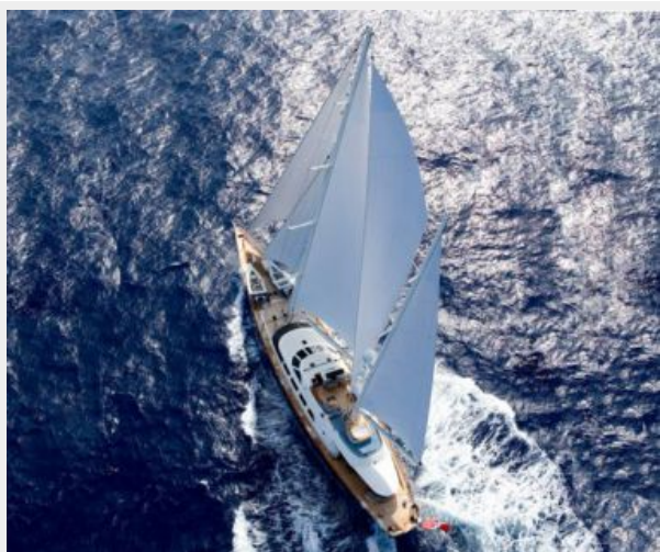
ANTARA - Perini Navi 46 meter (3)