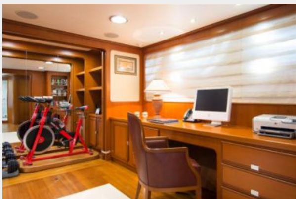
ANTARA - Perini Navi 46 meter (27)