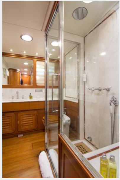
ANTARA - Perini Navi 46 meter (29)