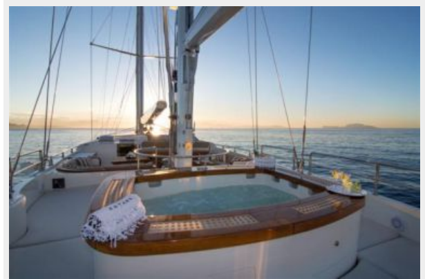
ANTARA - Perini Navi 46 meter (14)