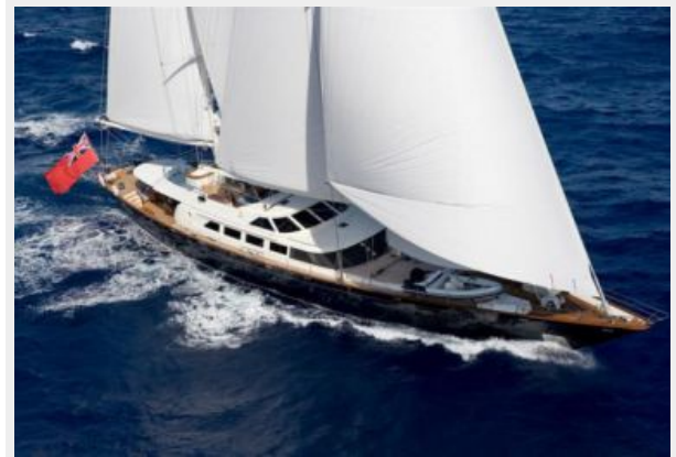
ANTARA - Perini Navi 46 meter (2)