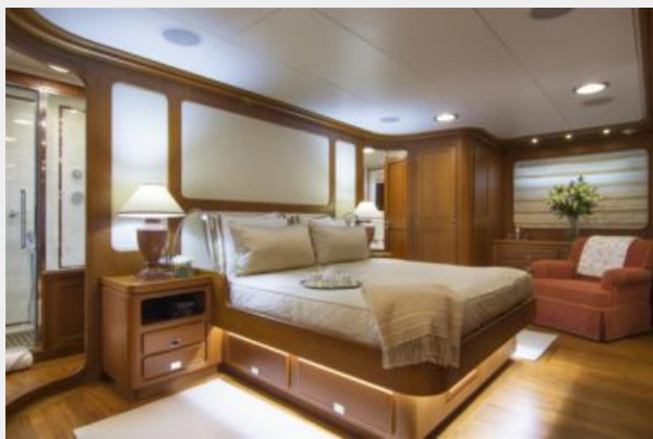
ANTARA - Perini Navi 46 meter (25)