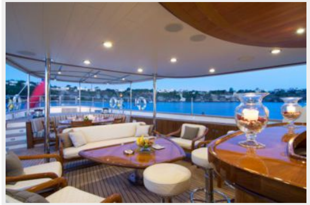
ANTARA - Perini Navi 46 meter (18)