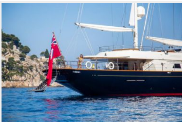
ANTARA - Perini Navi 46 meter (9)