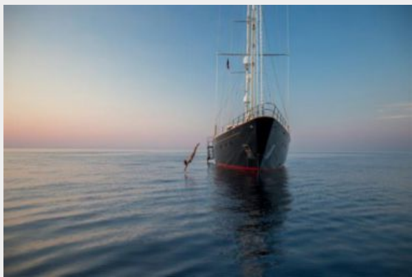
ANTARA - Perini Navi 46 meter (7)