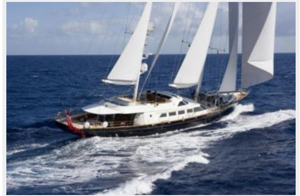
ANTARA - Perini Navi 46 meter (6)