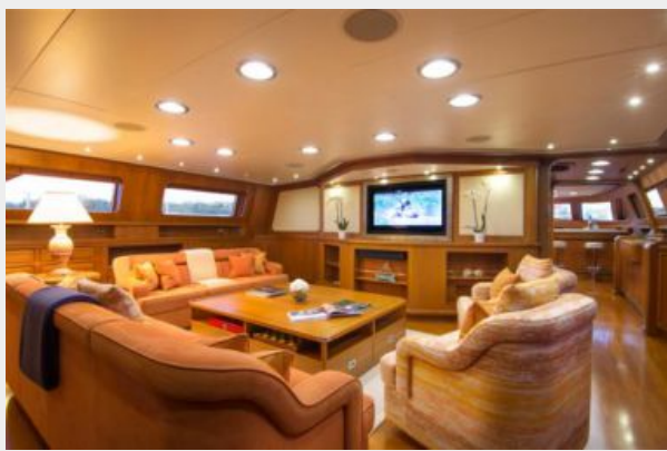
ANTARA - Perini Navi 46 meter (21)