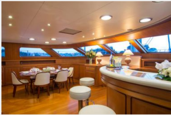
ANTARA - Perini Navi 46 meter (23)