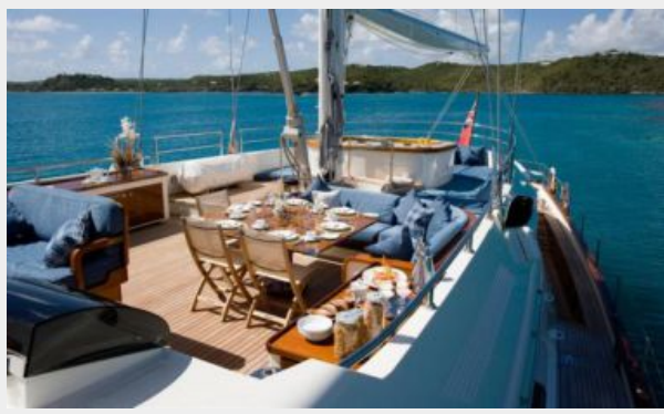
ANTARA - Perini Navi 46 meter (11)