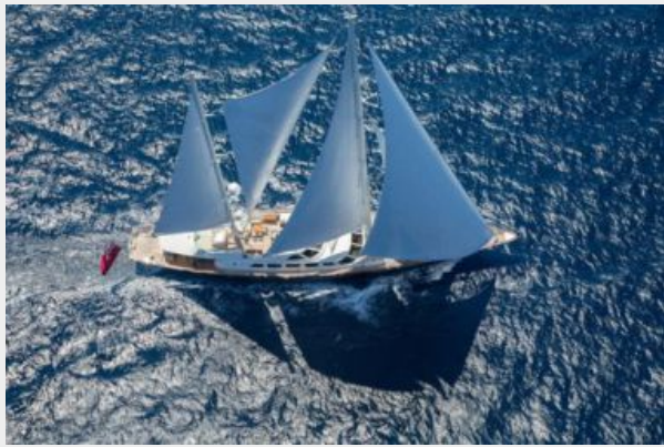
ANTARA - Perini Navi 46 meter (5)