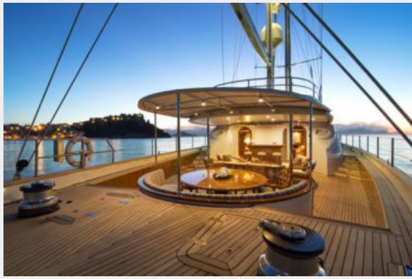
ANTARA - Perini Navi 46 meter (17)