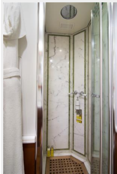
ANTARA - Perini Navi 46 meter (31)