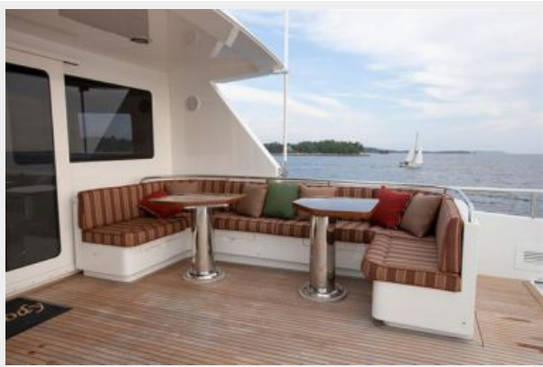
Upper Deck Seating