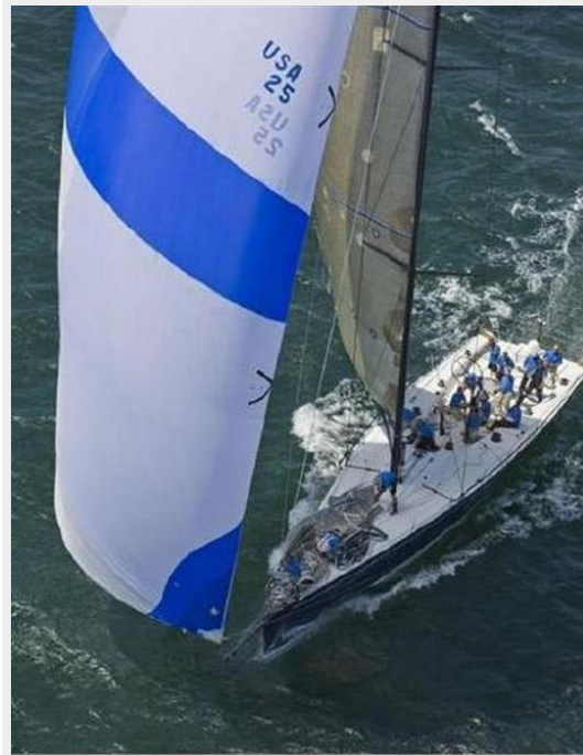
Kodiak skippered by Liwyd Ecclestone