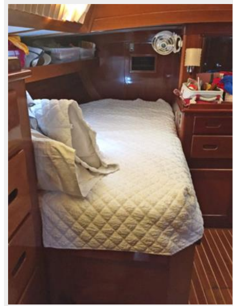
Aft Stateroom Stbd. Side