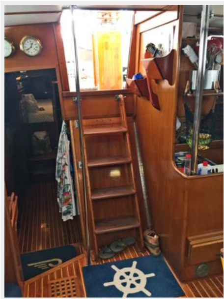
Looking Aft to Galley