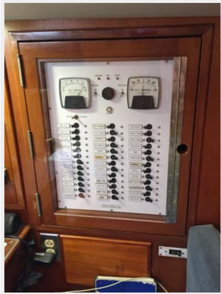
AC Electrical Panel