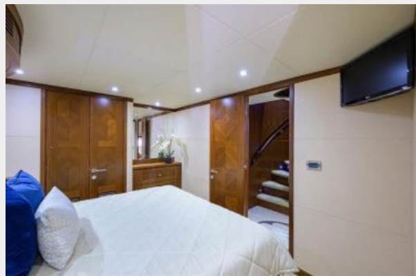
Wiggle Room_Guest Stateroom5