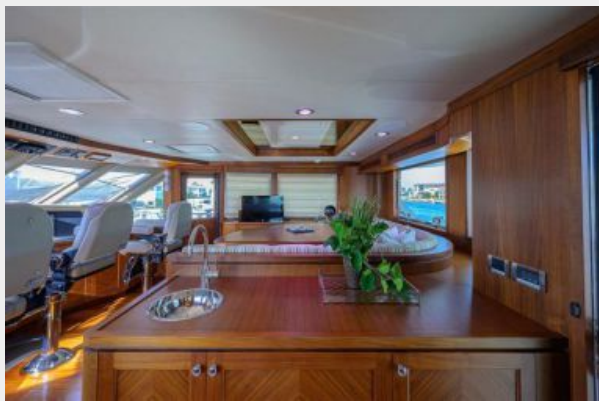
Wiggle Room_Enclosed Flybridge11