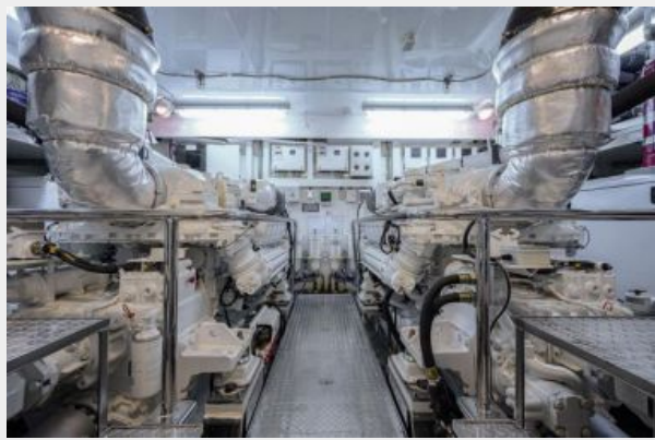
Wiggle Room_Engine Room1