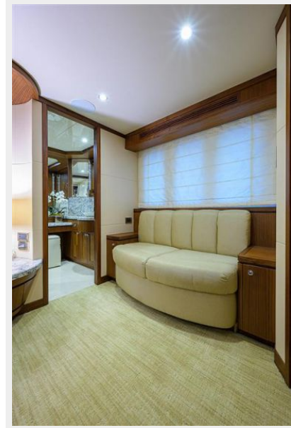
Wiggle Room_Master Stateroom8