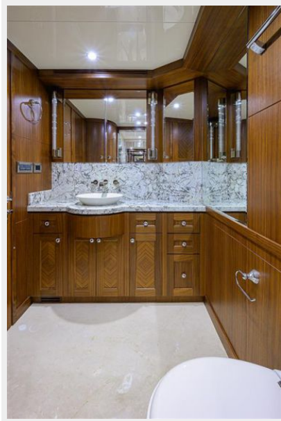
Wiggle Room_Master Head7