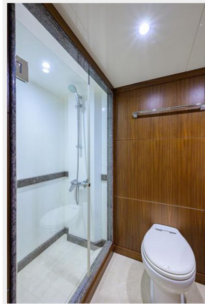
Wiggle Room_Guest Head2