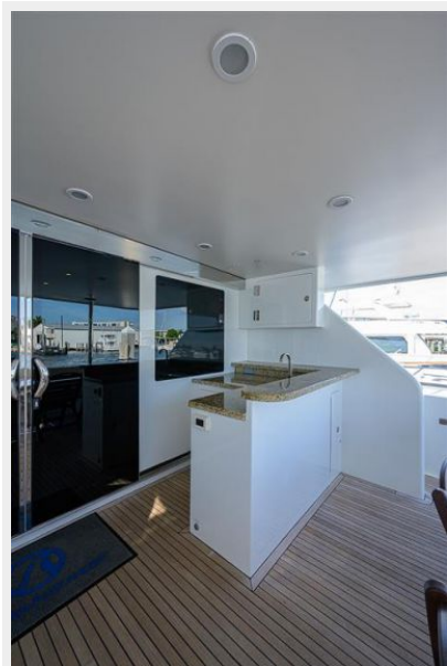
Wiggle Room_Aft Deck4