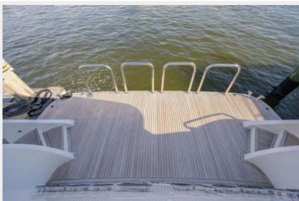
Wiggle Room_Swim Platform1