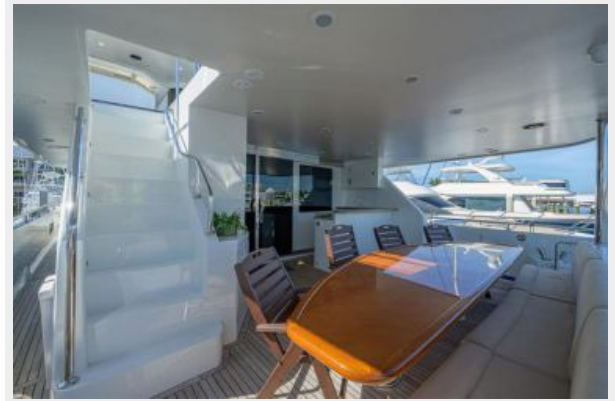
Wiggle Room_Aft Deck3