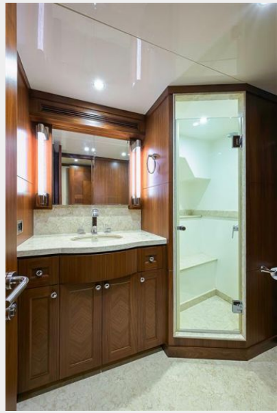
Wiggle Room_Forward Head1