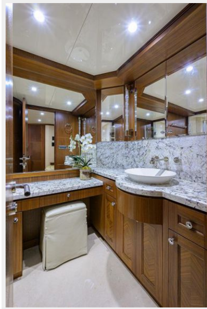
Wiggle Room_Master Head1