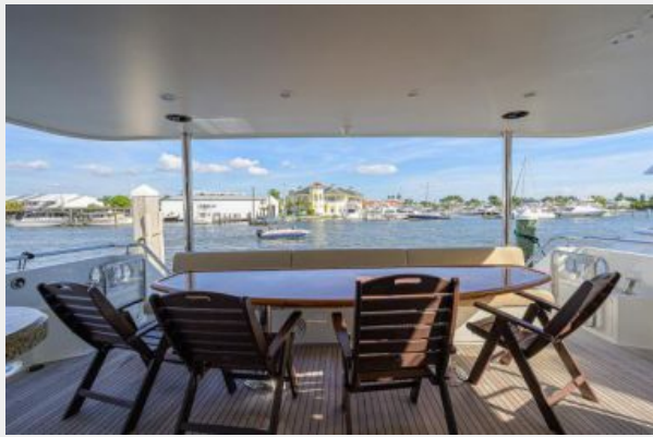
Wiggle Room_Aft Deck8