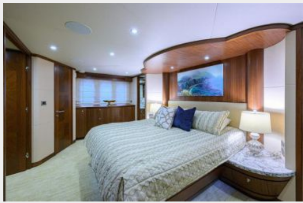
Wiggle Room_Master Stateroom3