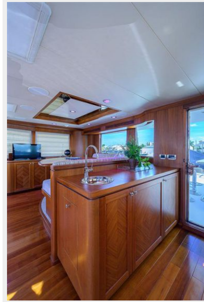
Wiggle Room_Enclosed Flybridge2