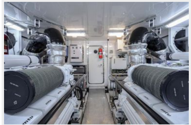
Wiggle Room_Engine Room4