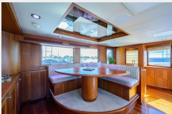
Wiggle Room_Enclosed Flybridge3