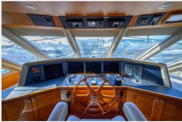
Wiggle Room_Enclosed Flybridge10