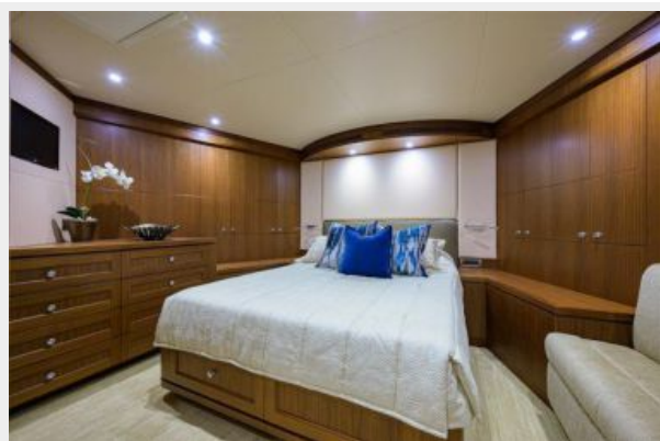
Wiggle Room_Forward Stateroom1