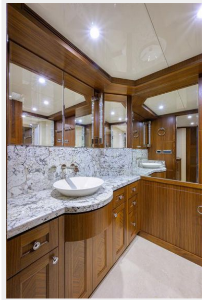
Wiggle Room_Master Head9