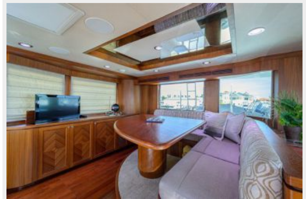
Wiggle Room_Enclosed Flybridge5