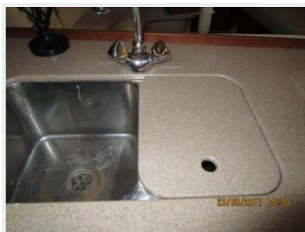
20-Pearl Galley Sink