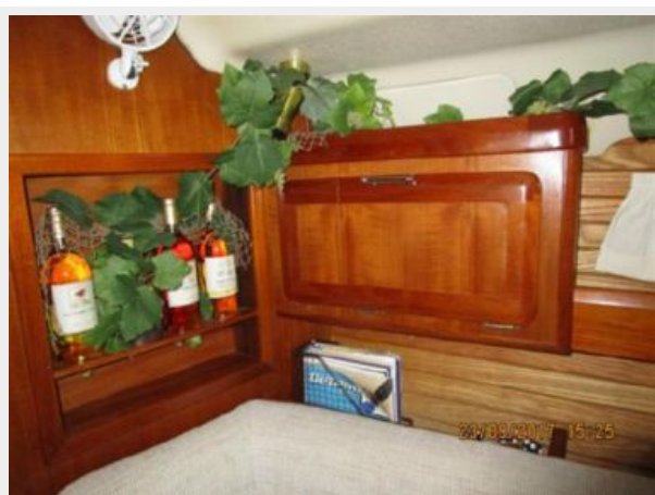
13-Pearl Salon Cabinetry 2