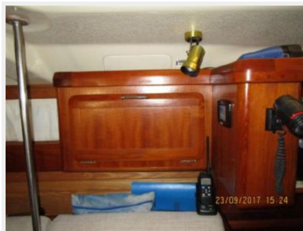
12-Pearl Salon Cabinetry