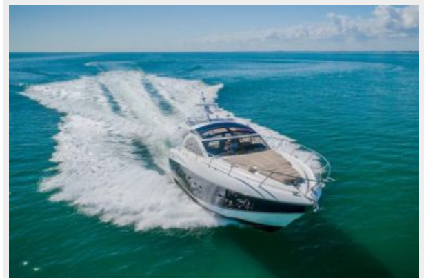
Starboard Bow Profile