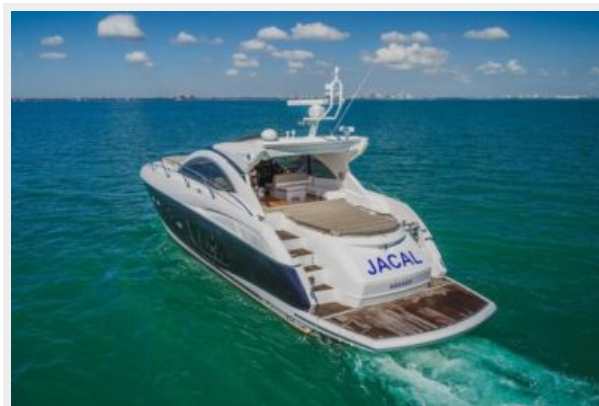
Port Stern Profile