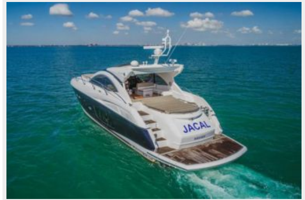
Port Stern Profile