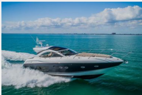
Starboard Running Profile