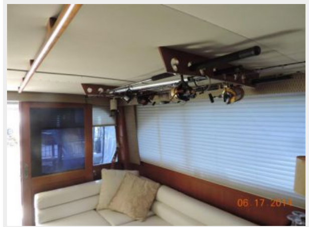
boss lady 3