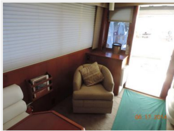
boss lady 4