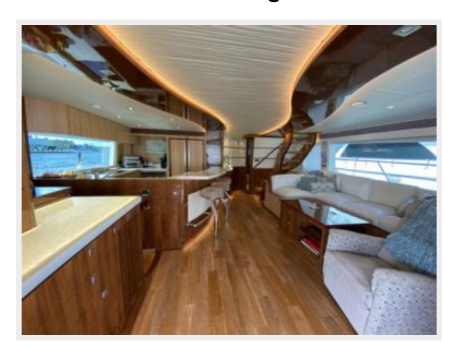
Salon Looking Fwd