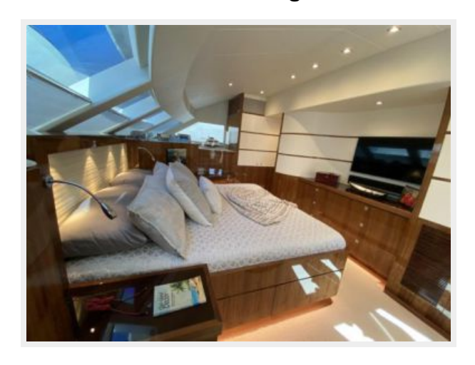
Master looking aft