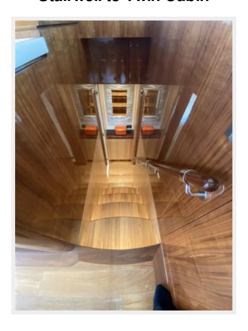
Stairwell to Twin Cabin