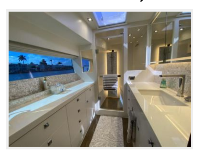
Shower And Vanity