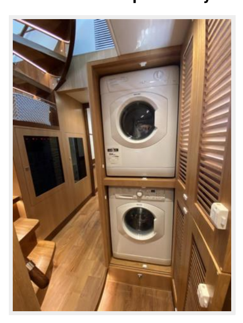
Washer and Separate Dryer