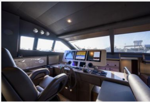
"Bella Rona" 2016 Ferretti 800 - Helm Station