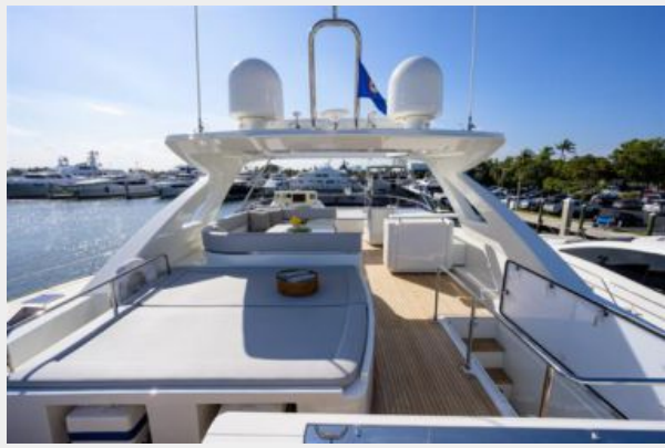
"Bella Rona" 2016 Ferretti 800 - Flybridge Seating