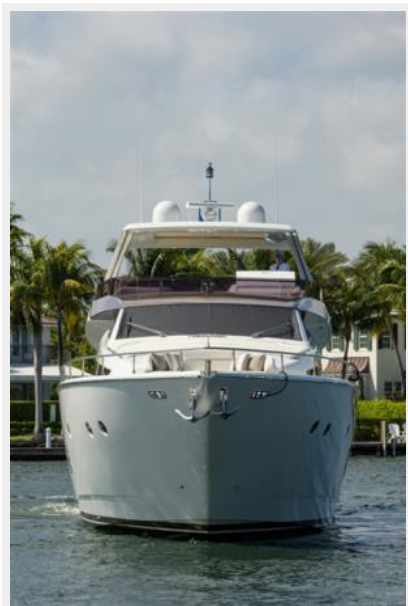
"Bella Rona" 2016 Ferretti 800 -Bow