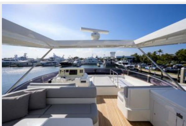
"Bella Rona" 2016 Ferretti 800 - Flybridge Seating