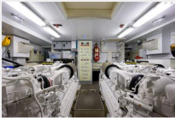
"Bella Rona" 2016 Ferretti 800 - Engine Room