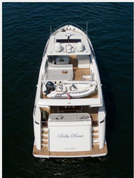
"Bella Rona" 2016 Ferretti 800 -Stern