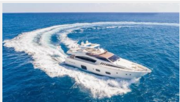
"Bella Rona" 2016 Ferretti 800 - Running