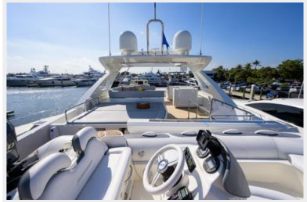
"Bella Rona" 2016 Ferretti 800