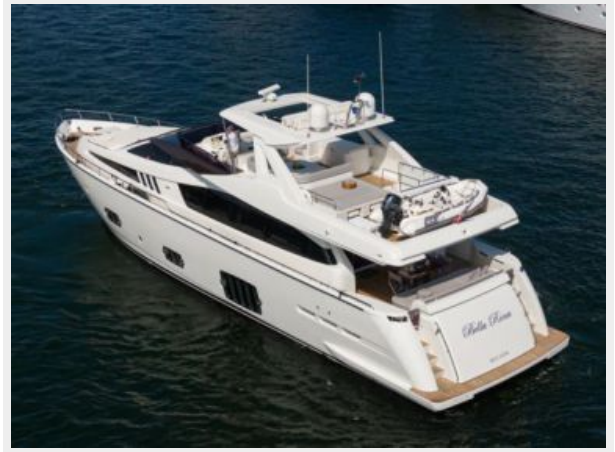
"Bella Rona" 2016 Ferretti 800 - Profile