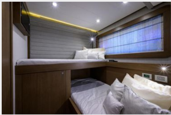
"Bella Rona" 2016 Ferretti 800 - Guest Stateroom