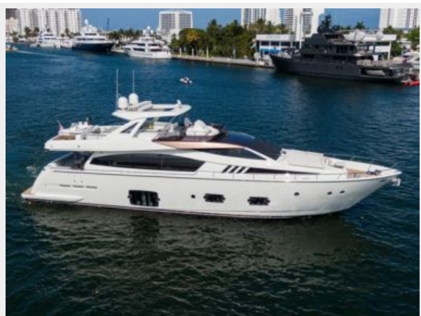
"Bella Rona" 2016 Ferretti 800 - Profile