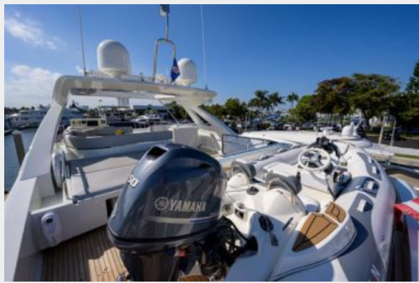
"Bella Rona" 2016 Ferretti 800 - Flybridge / Tender