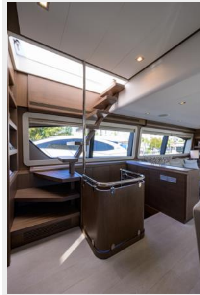
"Bella Rona" 2016 Ferretti 800 -Stair Way