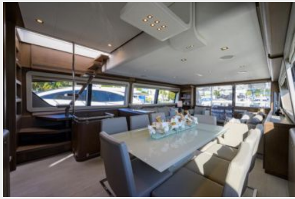
"Bella Rona" 2016 Ferretti 800 - Dining