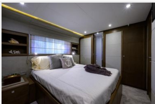
"Bella Rona" 2016 Ferretti 800 -VIP Stateroom