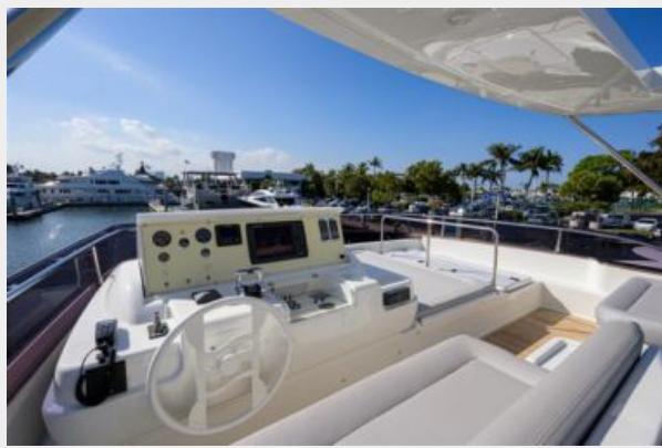
"Bella Rona" 2016 Ferretti 800 - Flybridge Helm