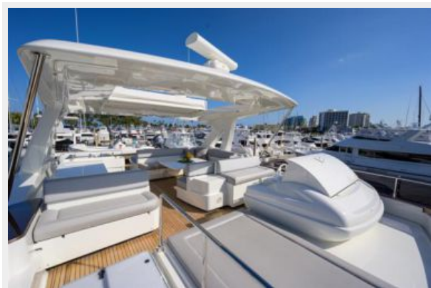
"Bella Rona" 2016 Ferretti 800 - Flybridge