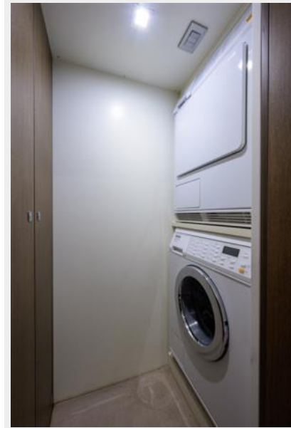
"Bella Rona" 2016 Ferretti 800 - Laundry