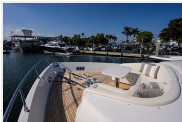
"Bella Rona" 2016 Ferretti 800 - Bow