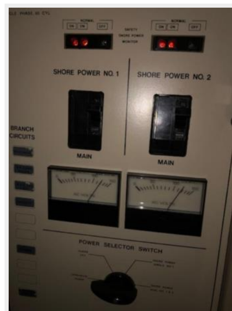
13_ELECTRIC PANEL AC READINGS