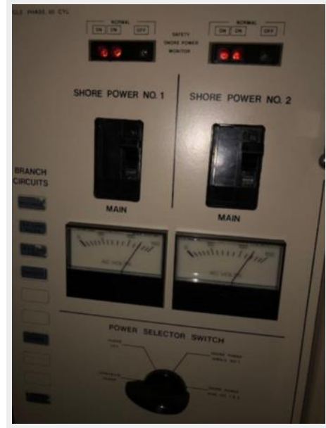
13_ELECTRIC PANEL AC READINGS