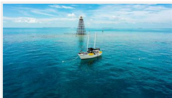
Conch Pearl moored at Sand Key