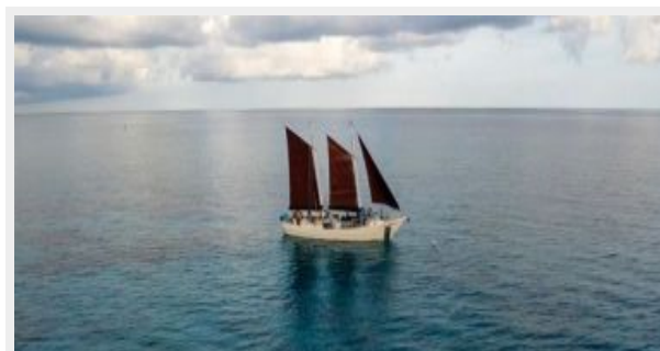
Conch Pearl undersail stbd side