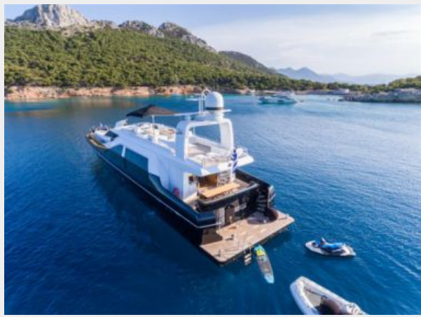
AQUARELLA_Lo-2-credit Quin BISSET-3