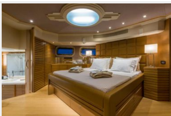
AQUARELLA_Lo--credit Quin BISSET-6