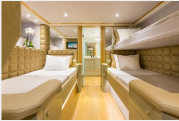
AQUARELLA_Lo--credit Quin BISSET-3