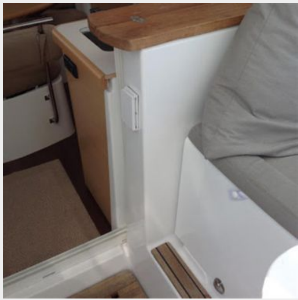
Modification Xalay 4