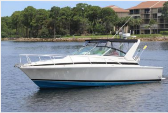
2_1994 30ft Bertram 30 Moppie SEA ESTA 2_7339895_20200219130106305_5_XLARGE