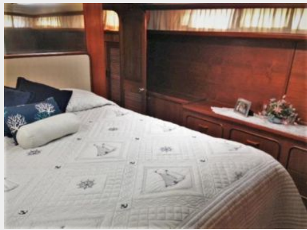
master stateroom portside