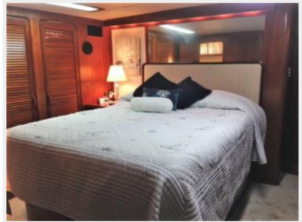
master stateroom looking forward