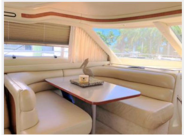
48 Sea Ray Salon Dinette