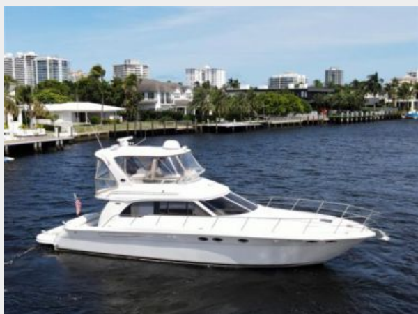
48 Sea Ray Starboard Side Profile