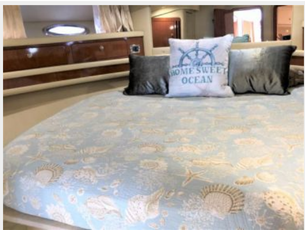
48 Sea Ray Forward Stateroom