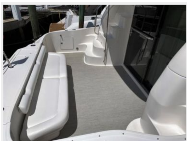
48 Sea Ray Cockpit 2