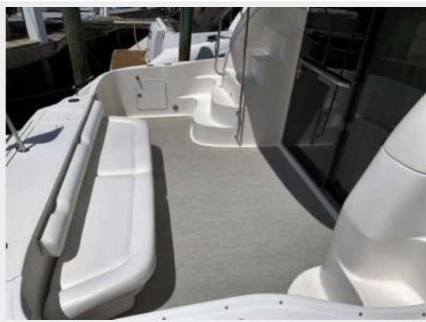
48 Sea Ray Cockpit 2