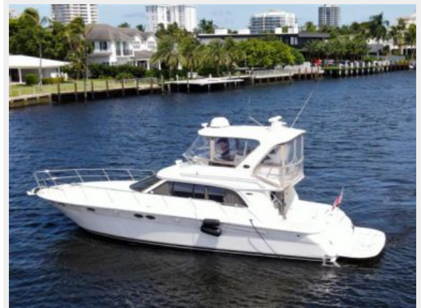
48 Sea Ray Port Side Profile