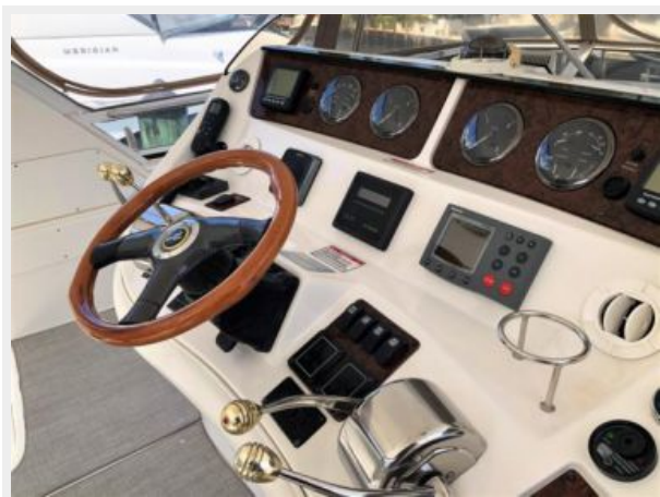
48 Sea Ray Bridge Helm