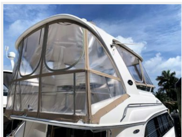
48 Sea Ray Exterior Bridge