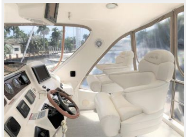
48 Sea Ray Bridge