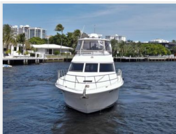
48 Sea Ray Bow