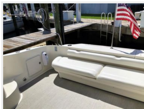
48 Sea Ray Cockpit