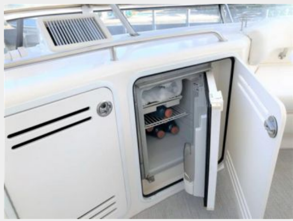
48 Sea Ray Bridge Wet Bar Fridge