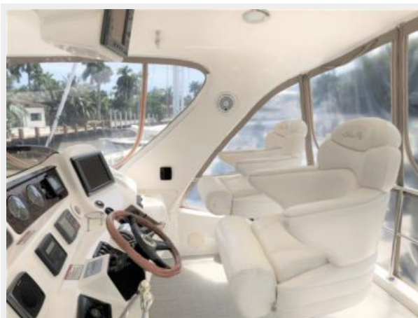
48 Sea Ray Bridge