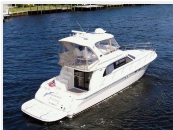
48 Sea Ray Exterior Starboard Stern