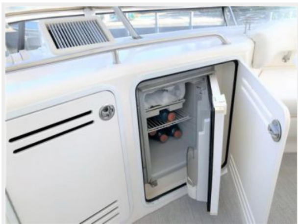
48 Sea Ray Bridge Wet Bar Fridge