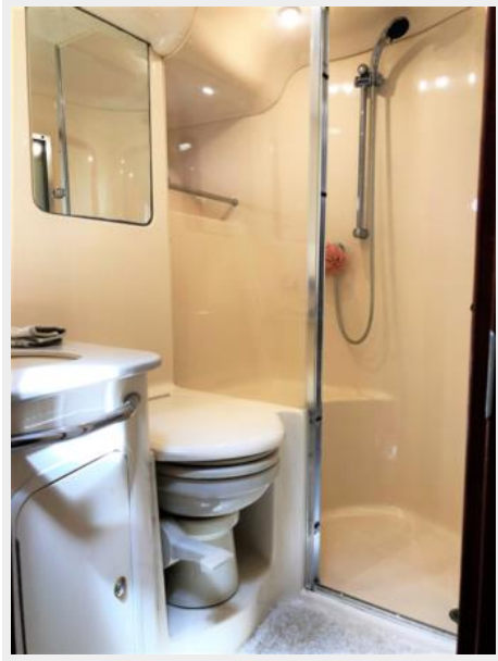
48 Sea Ray Starboard Side Head