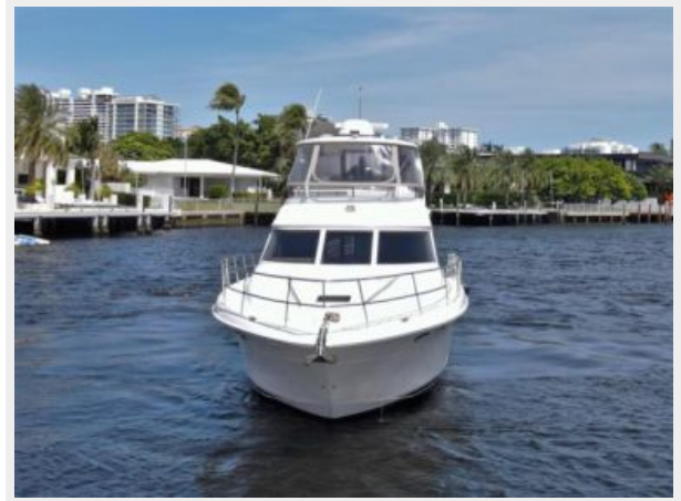
48 Sea Ray Bow