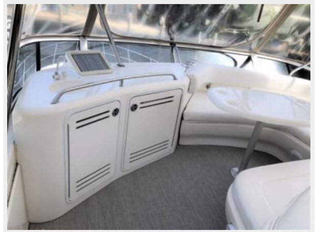
48 Sea Ray Bridge Wet Bar