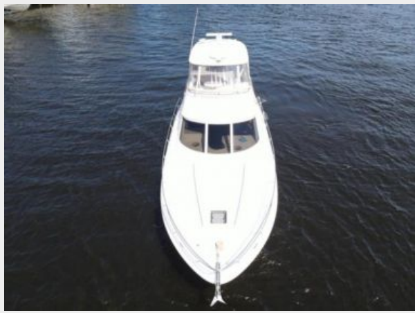
48 sea ray 3