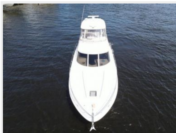
48 sea ray 3