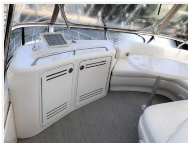
48 Sea Ray Bridge Wet Bar