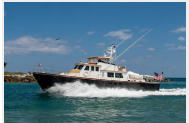
RM-72 Medora GA-1