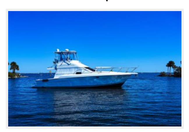
1 Novel Idea Profile picture resized