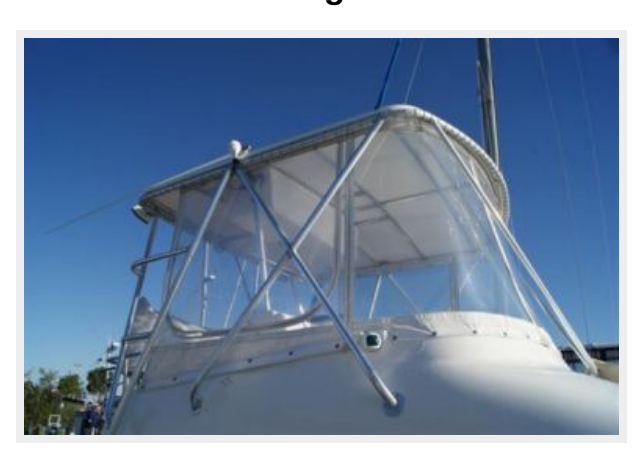
109 Bridge Stbd