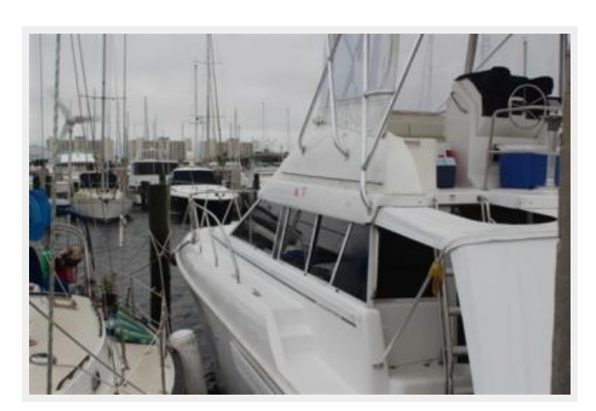
119 Port Deck