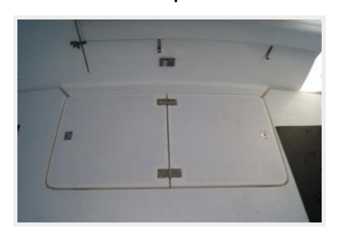
115 Cockpit Deck