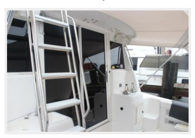
116 Cockpit Fwd