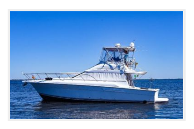
104 Port Side