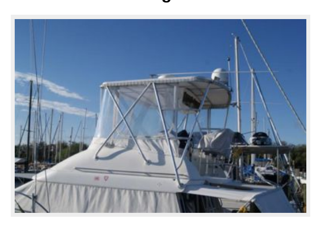
110 Bridge Stbd