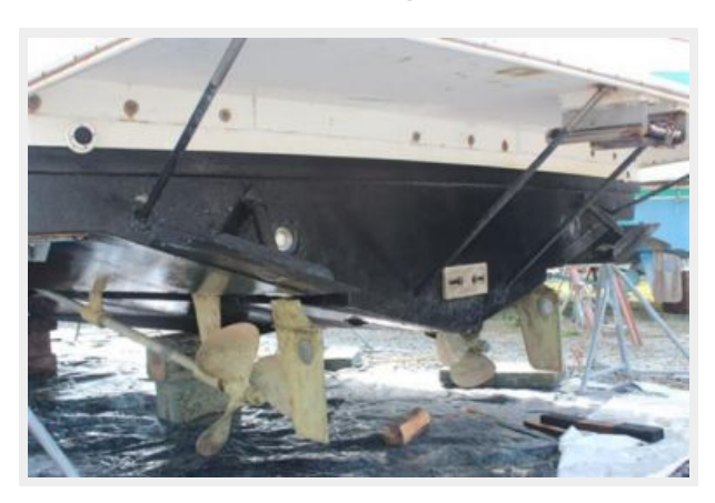
120 Running Gear