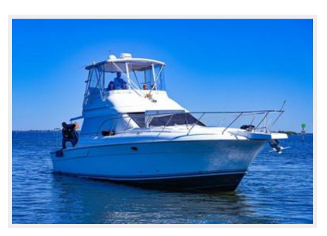
108 Stbd Fwd