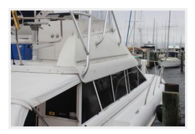
118 Stbd Deck