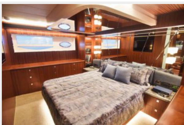
Master SR 2