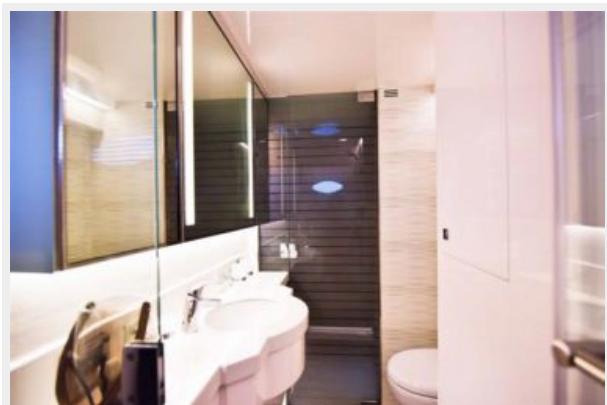
Master Head 1