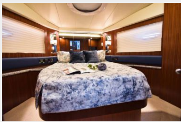
Forward SR 2