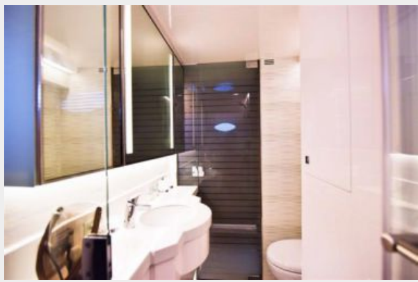
Master Head 2