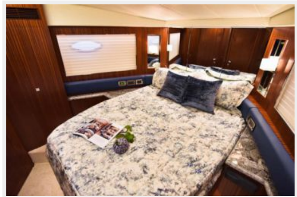
Forward SR 2