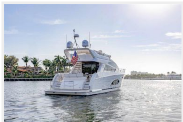
Profile Aft View