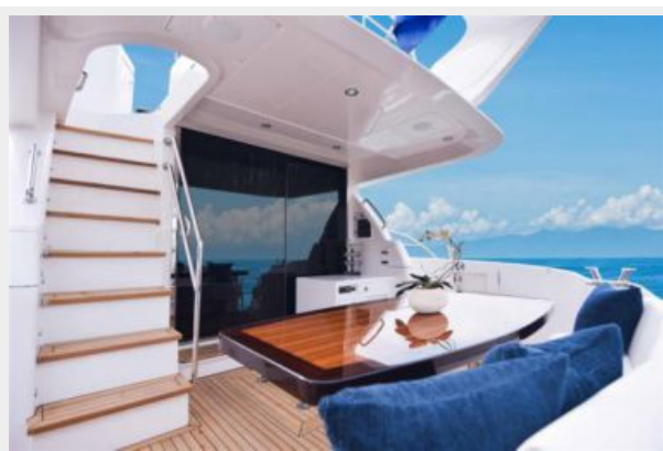
Aft Deck 1