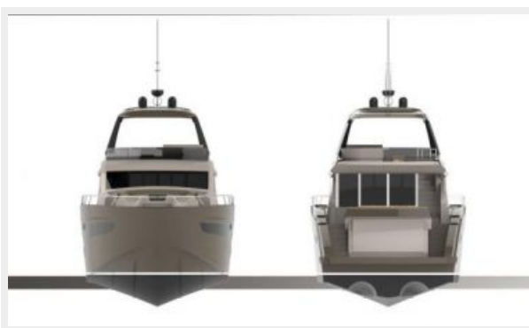
Bow & Stern view