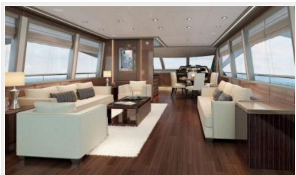
Lounge facing bow