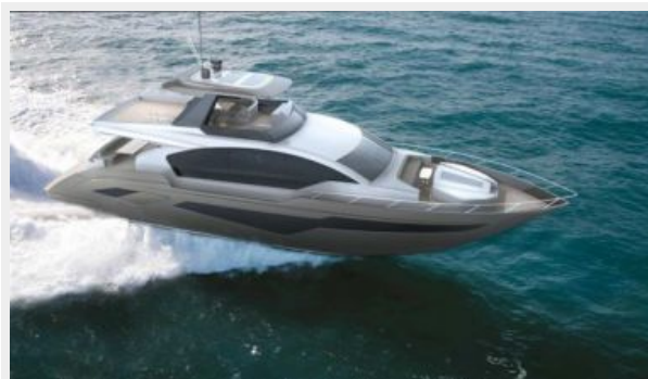
At speed bow