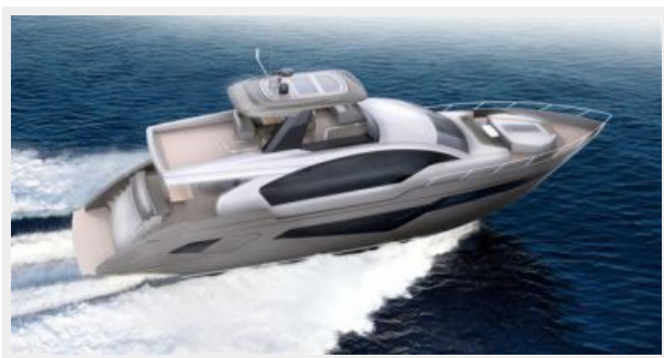
At speed stern