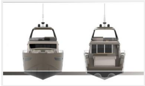
Bow & Stern view