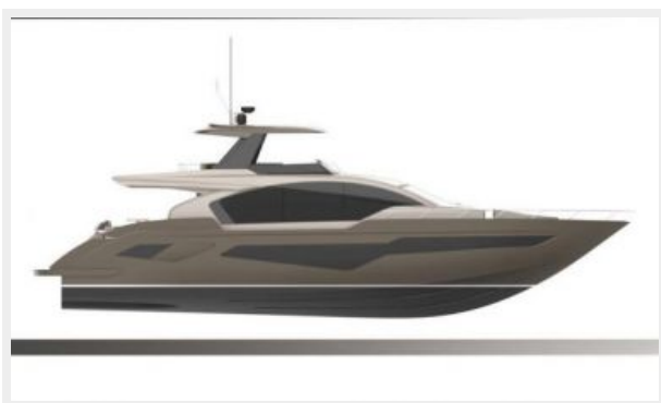
Full view SB