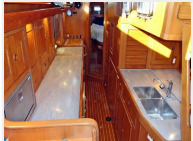
Galley, Looking Aft