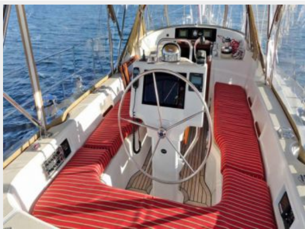
Cockpit, Looking Forward