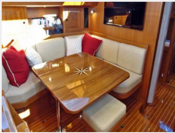
Main Salon, Port