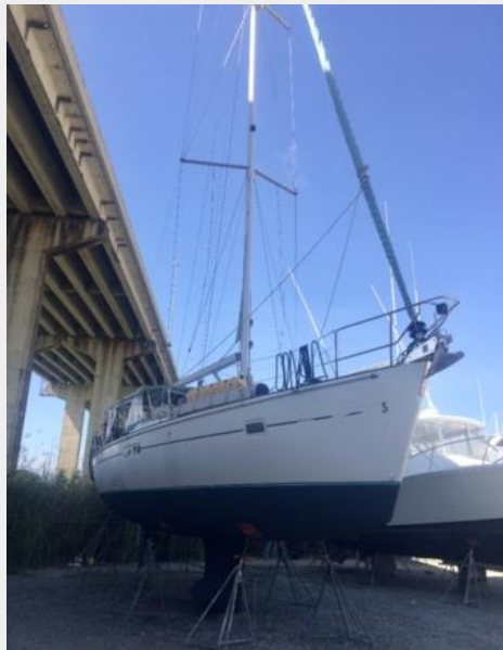
1 Lagniappe 2006 43' Robbins