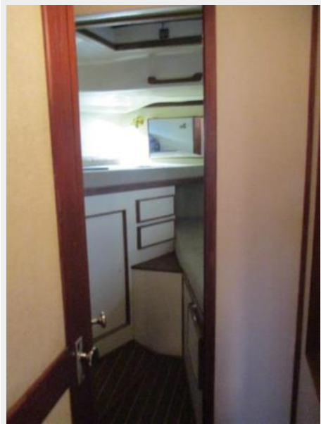
25. 41' Morgan Salon View To Forward Berth