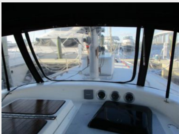
7. 41' Morgan Cockpit View Forward