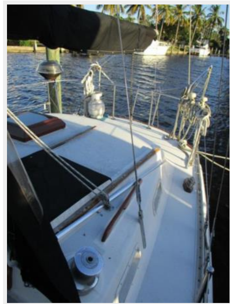
16. 41' Morgan Port Aft