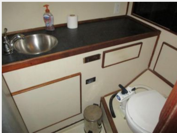
35. 41' Morgan Aft Sink & Storage