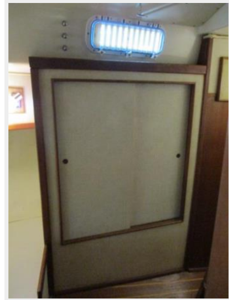
36. 41' Morgan Aft Master Storage Closet