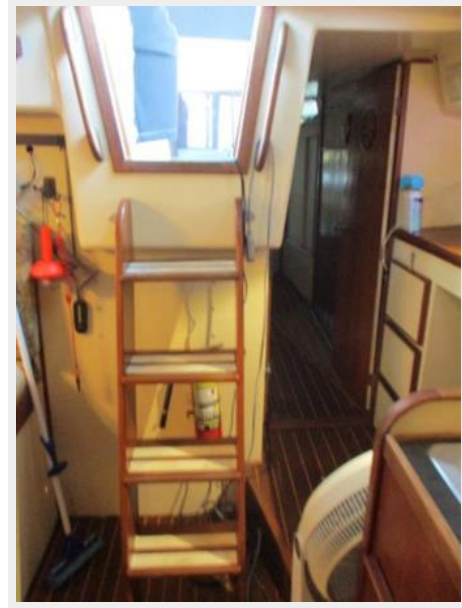
20. 41' Morgan Salon View Aft