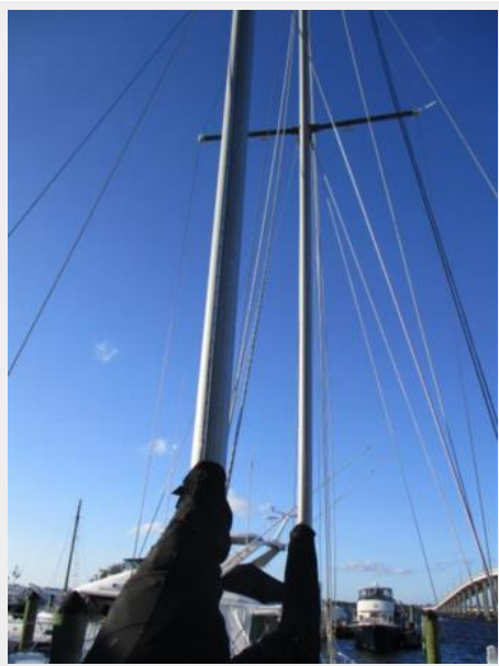
15. 41' Morgan Mizzen & Main Masts