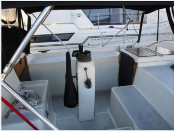
9. 41' Morgan Cockpit Side Profile