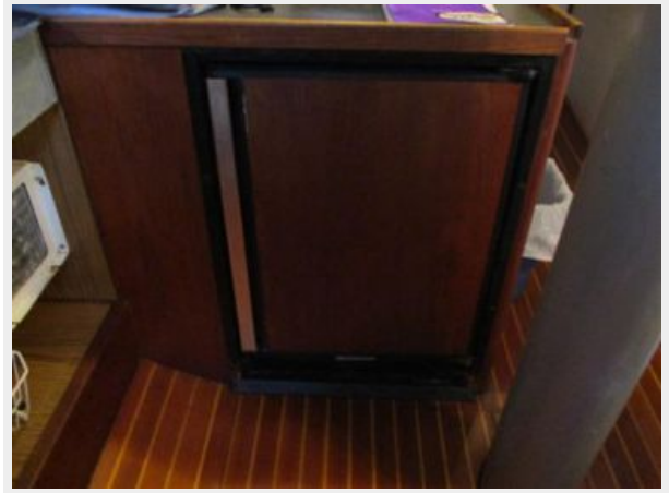
24. 41' Norcold Refrigerator