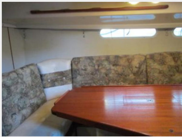
19. 41' Morgan Settee View 3