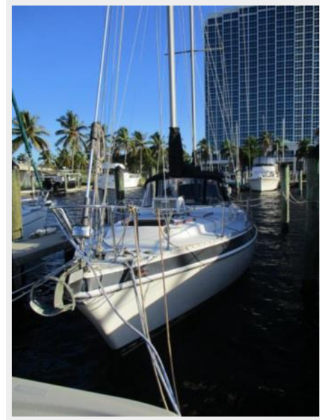
2.42 Morgan Port View