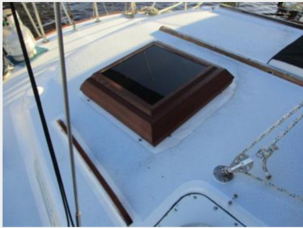
13.41' Morgan Aft Stateroom Hatch