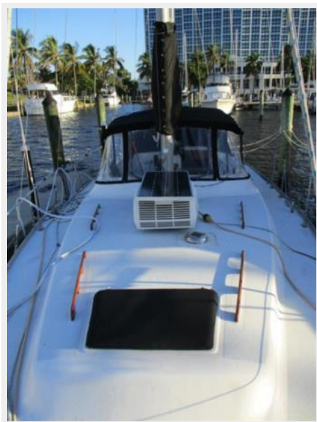
3. 41' Morgan Deck View Aft