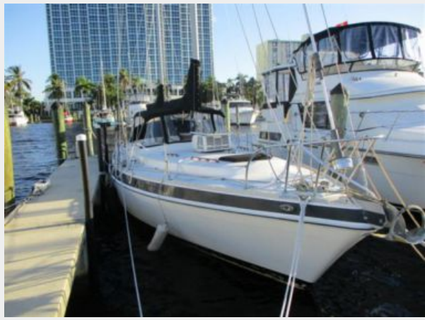
1. Morgan Profile