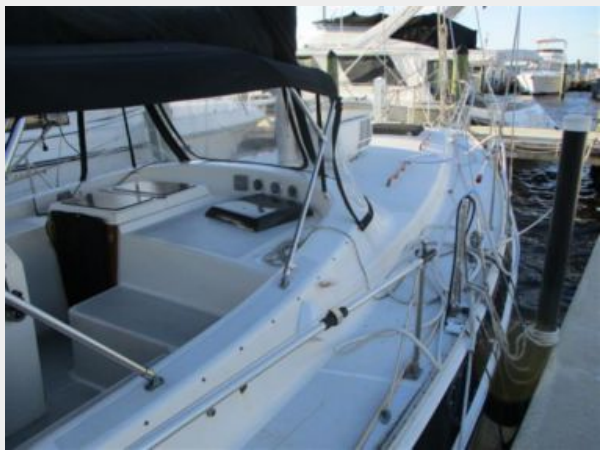
5. 41' Morgan Starboard View Forward