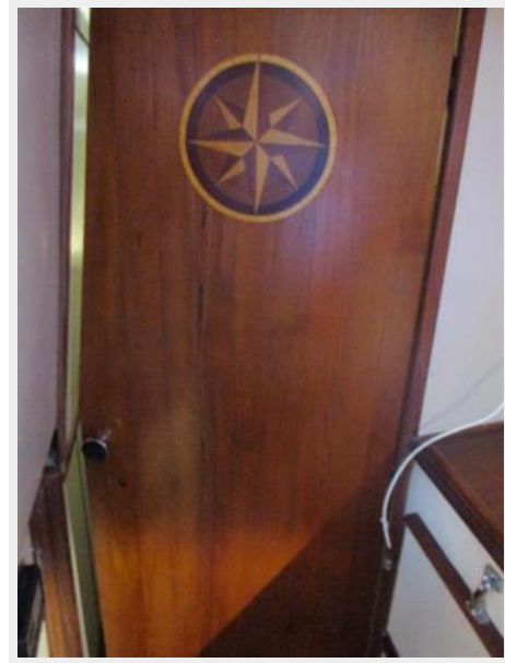
32. 41' Morgan Aft Master Teak Entry Door (1)