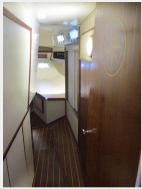
31. 41' Morgan View Aft To Master Stateroom