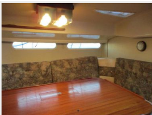
17.41' Morgan Settee to Starboard