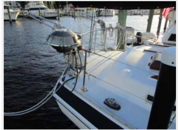
14. 41' Morgan Grille & Davits