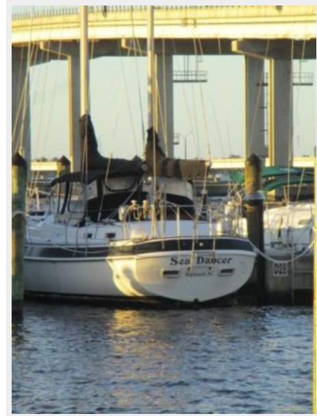
6. 41' Morgan Transom View