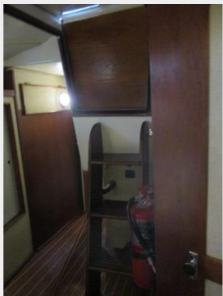
37. 41' Morgan Aft Master Exit Hatch