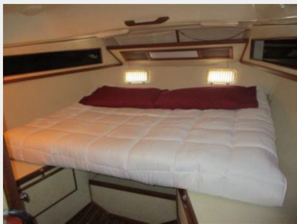
33. 41' Morgan Aft Master