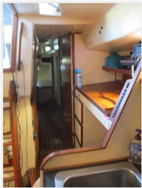
21. 41' Morgan Nav Station View To Aft Master