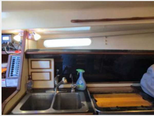
23. 41_ Morgan Galley View 2