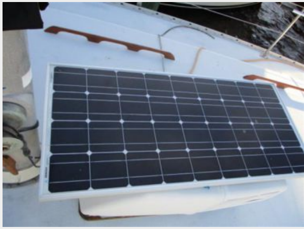
43. 41' Morgan Solar Panel